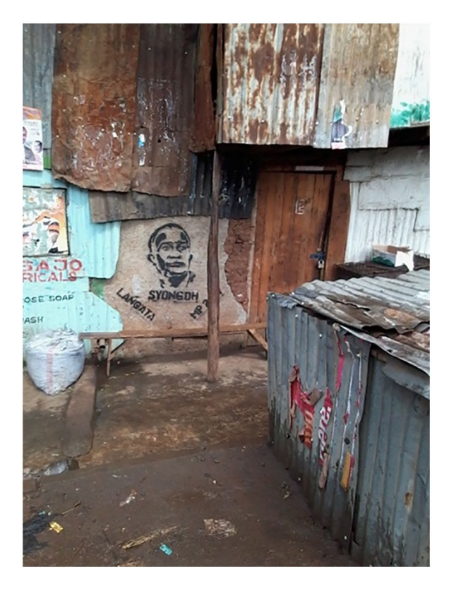
Figure 1. Photovoice project – political stencil on corrugated iron walls – May 2017.

message of mistrust appears to have been communicated and, as a result, there was an increasing sense that the agenda of the politicians was being questioned: