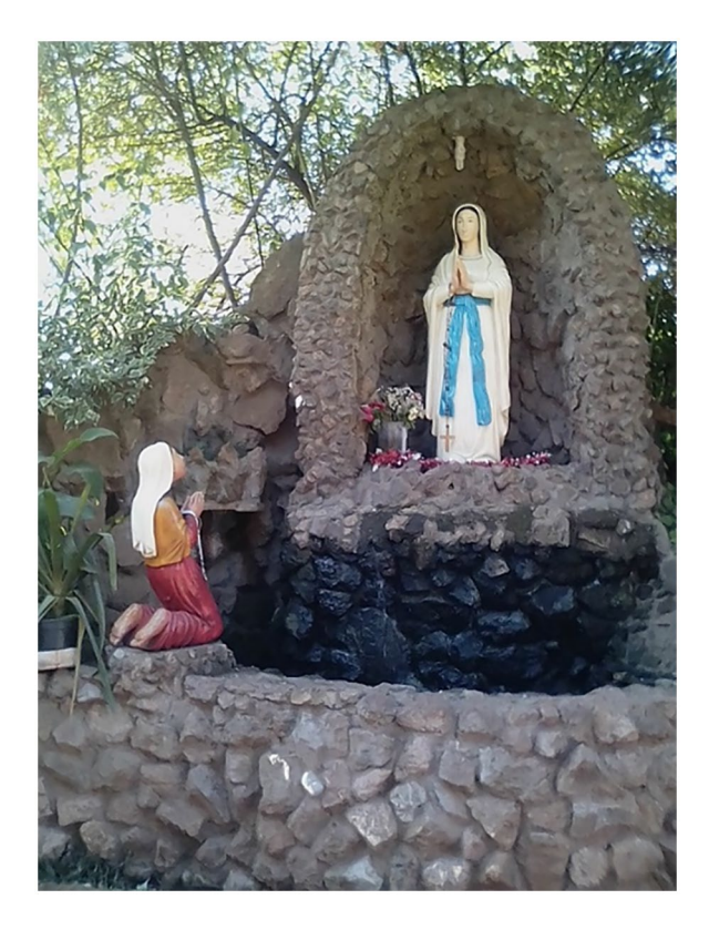
Figure 4. Photovoice project – religious symbols – January 2018.

The church was also instrumental in relaying the peace messages and this was noted by a number of participants in the interviews and the photovoice project (see Figure 4):