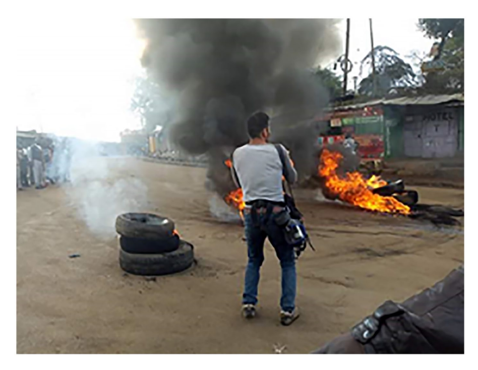
Figure 2. Photovoice project – international media crew filming violence in Kibera behind burning tyres – January 2018.

These factors appeared to contribute to the ways in which the community members dealt with political uncertainty, largely through management of potential risks, and targeted messages of peace which were broadcast through a number of sources. As a result, people felt they had information which they lacked previously: