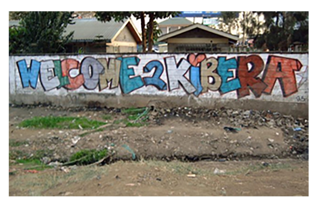
Figure 6. Photovoice project – mural on external wall reading Welcome 2 Kibera – May 2017.

All of the participants in the photovoice project identified the importance and impact of art and culture in relaying messages of peace, and also in affirming identity which transcended ethnic divides, appearing to support the concept of conscientisation. There appeared to be pride in coming from Kibera that enhanced identity, and a number of images captured the vibrancy of artistic expression within the area (Figure 6):