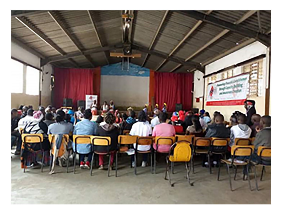
Figure 3. Photovoice project – an education workshop showing a crowd facing a stage as a presentation takes place – May 2017.

Images from the photovoice project often captured education sessions see Figure 3, and these were seen as positive factors.