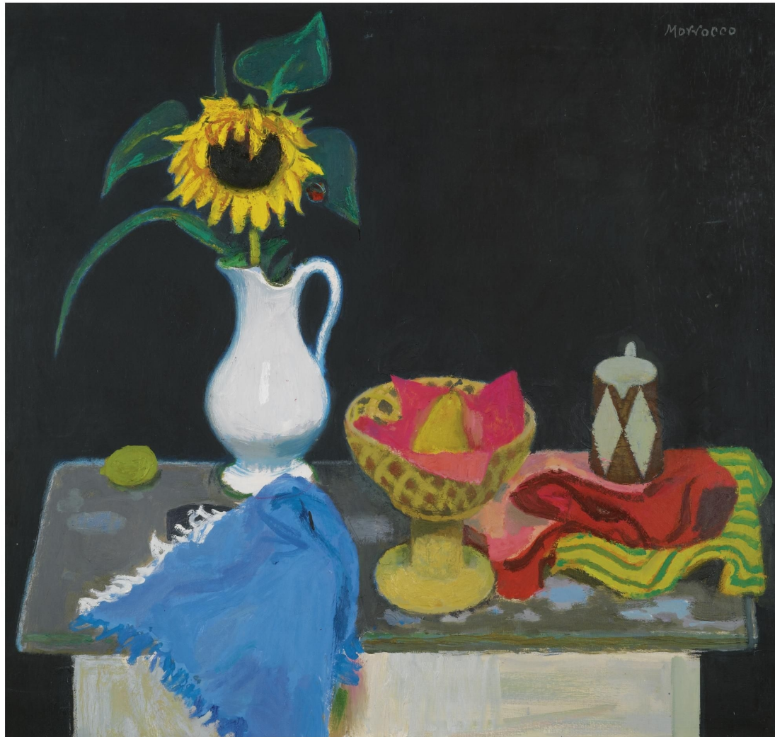
Alberto Morrocco, Still life with Sunflower oil on board, 86.5 x 81 cm