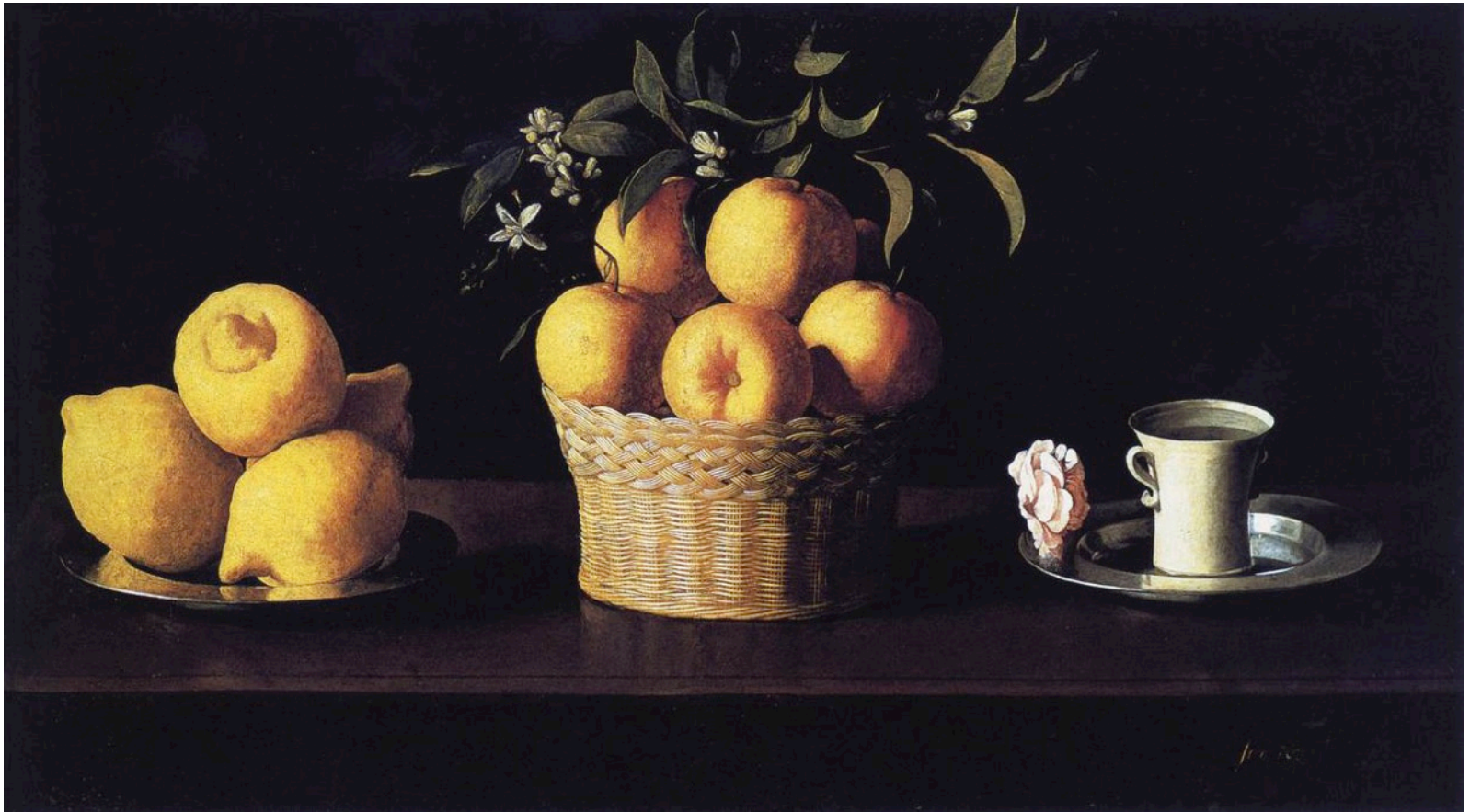
Francisco de Zurbarán, Still Life with Lemons, Oranges and a Rose , 1633, oil on canvas, 62.2 x 107cm