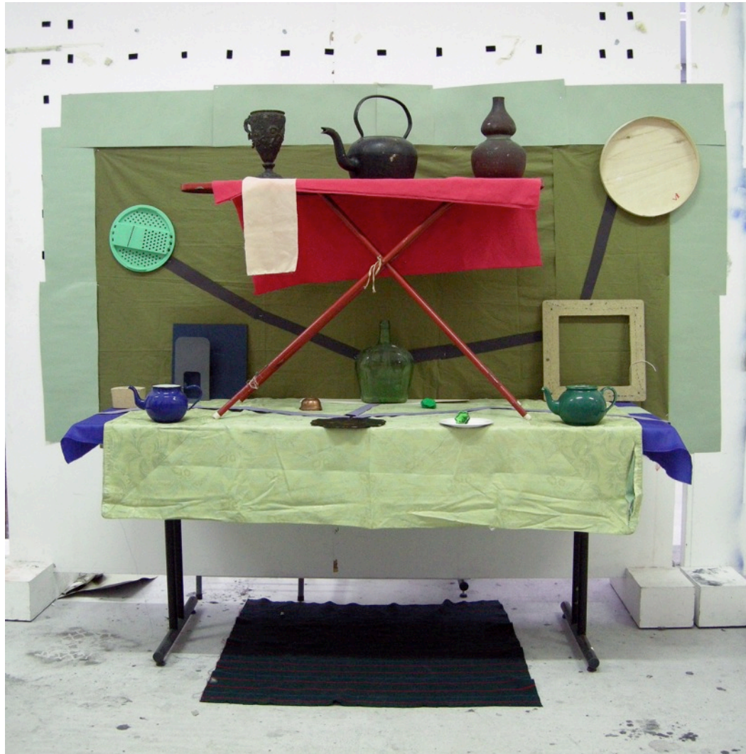
1 st Year Still Life Set-up, Gray's School of Art, 2009