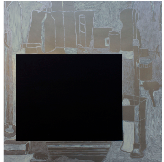
Lyndsey Gilmour Reflection, deflection III 2016, Oil and enamel on steel 61 x 60 cm