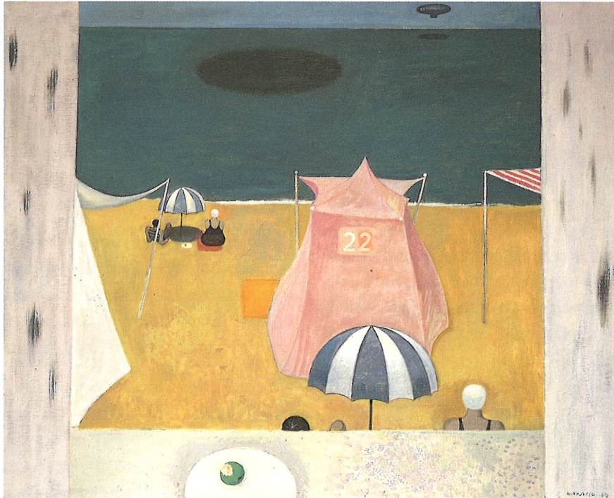
Alberto Morrocco The Dirigible over Deauville 1969, oil on canvas 101.6 x 127 cm