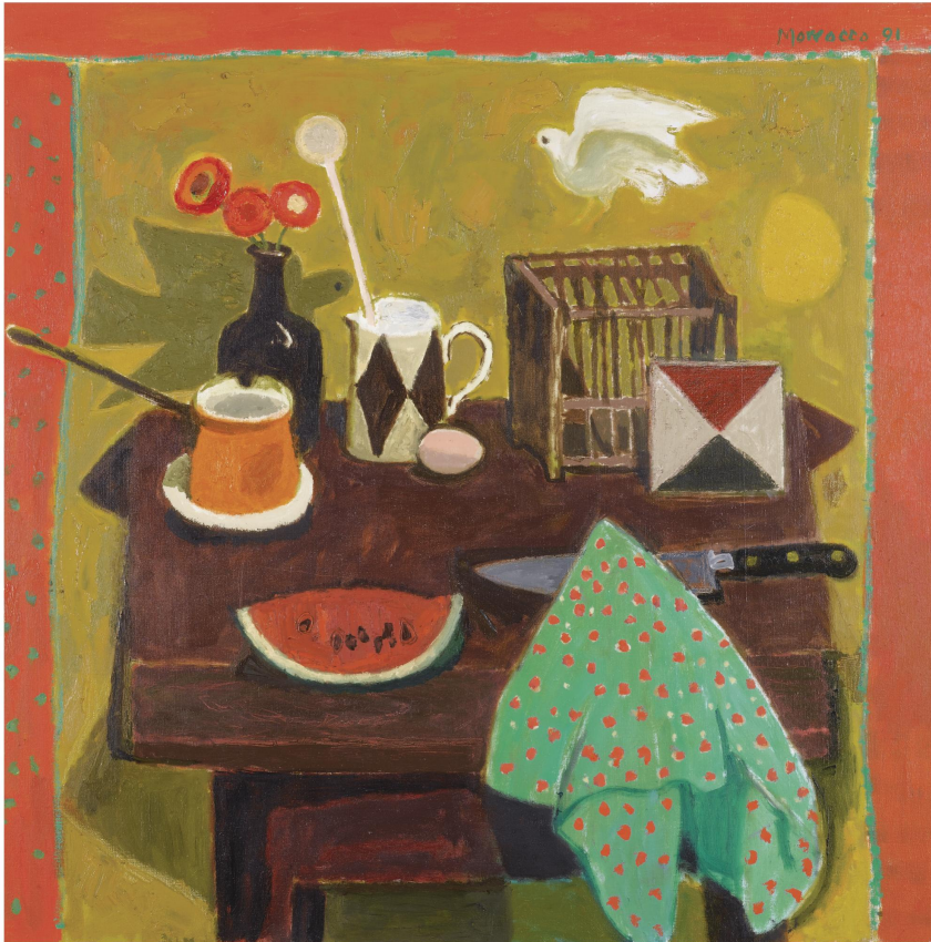
Alberto Morrocco Homage a Braque , 1991, oil on canvas 76.2 x 76.2 cm