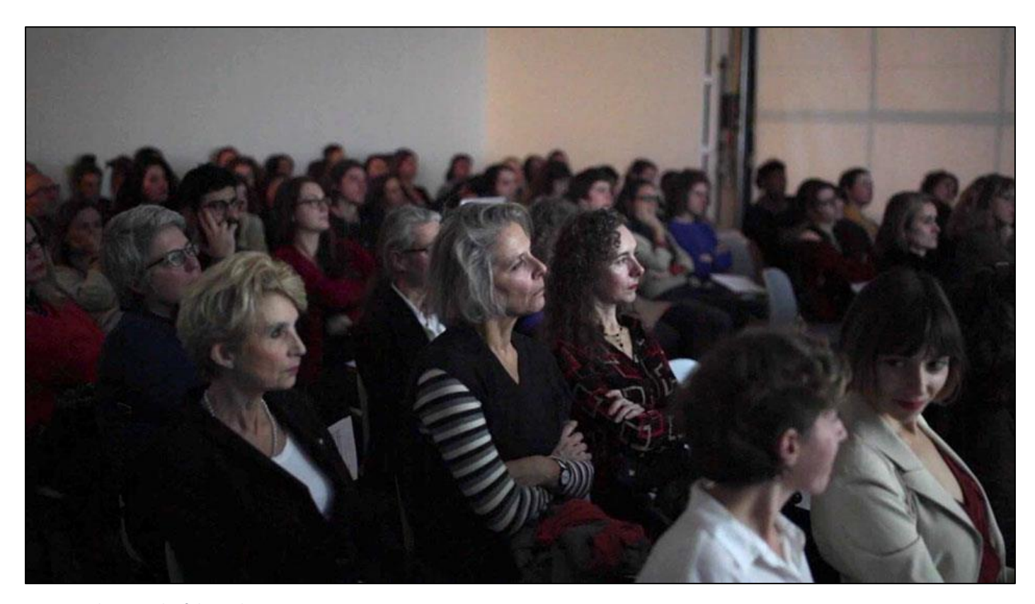
Figure 8. Photograph of the audience.

Figure 7. (Link only) - Photograph of the screening, showing a still from "Dust Grains" (2014) by Elisabetta di Sopra.