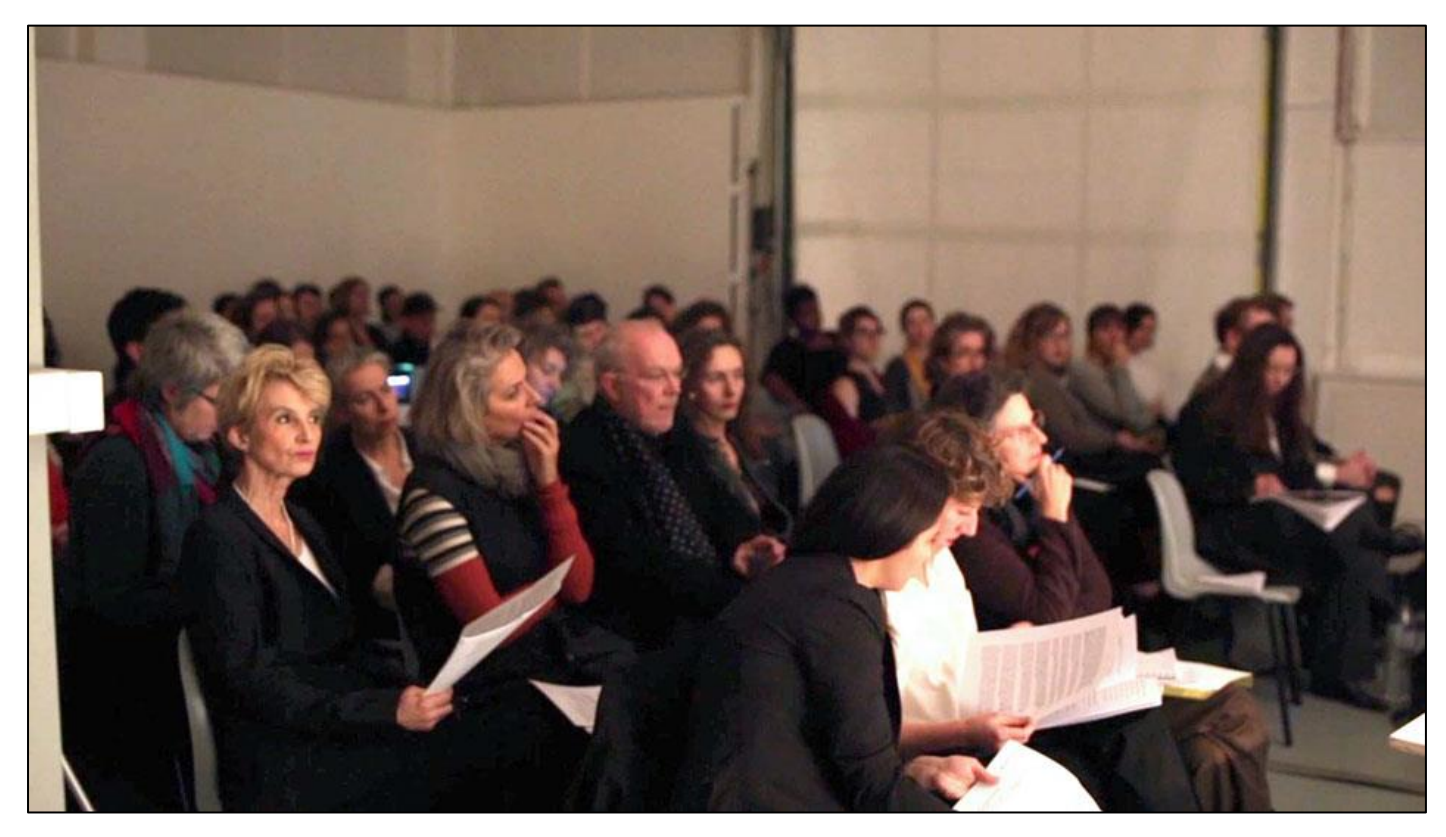
Figure 2. Photograph of the audience.