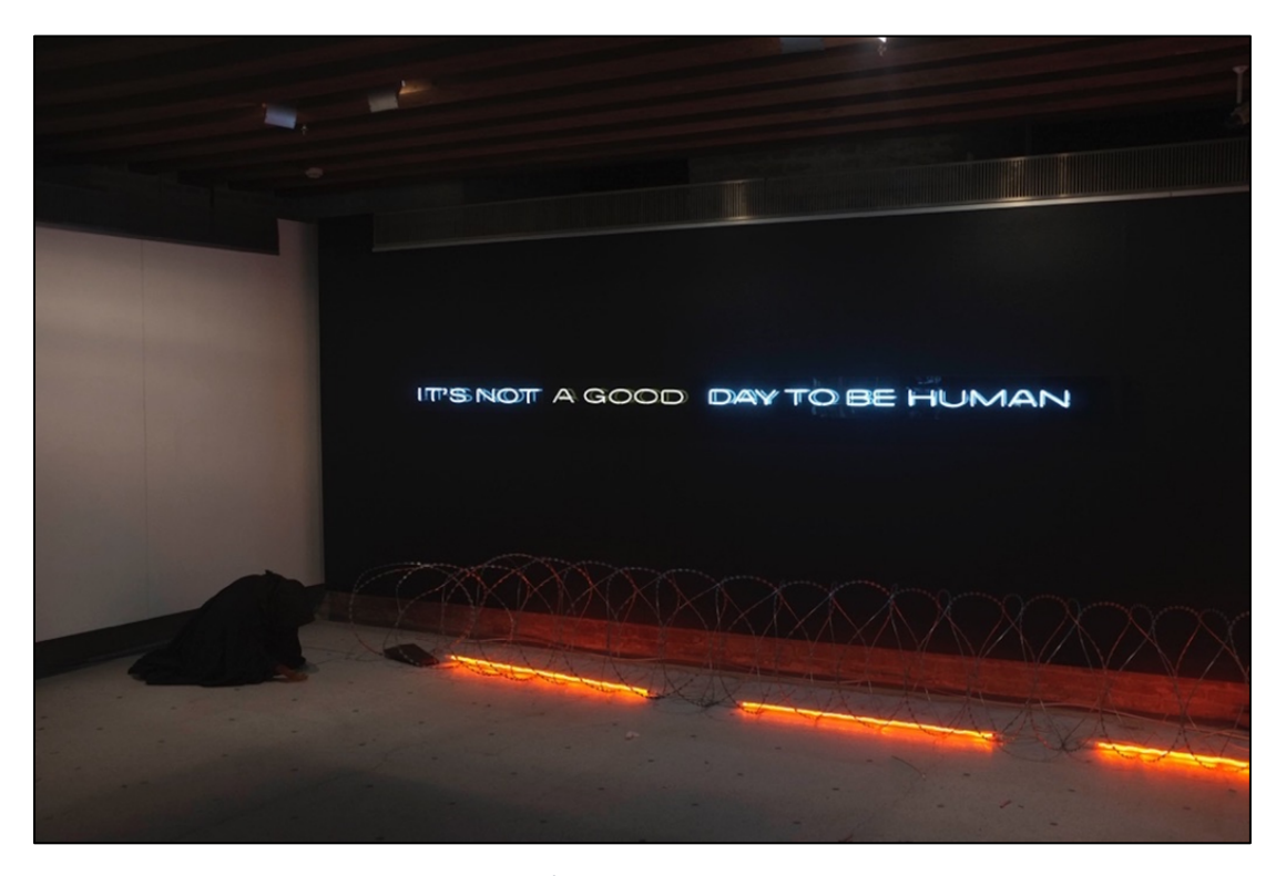
Figure 2. Federica Marangoni, Il filo conduttore / The Leading Thread, 2015, multi media installation, Venice, Ca' Pesaro - Galleria Internazionale di Arte Moderna, detail.

The other was a silent room, with a silent video: just my hand, that writes on a wall directly in neon. These are the screams that I address to humanity. My hand keeps silently writing. This is my last piece connecting research with video and neon — without having the real neon. In the second room on the black wall, behind the barbed wire with red neon hung a long sign in white neon — about 5 metres: "It's not a good day to be human."