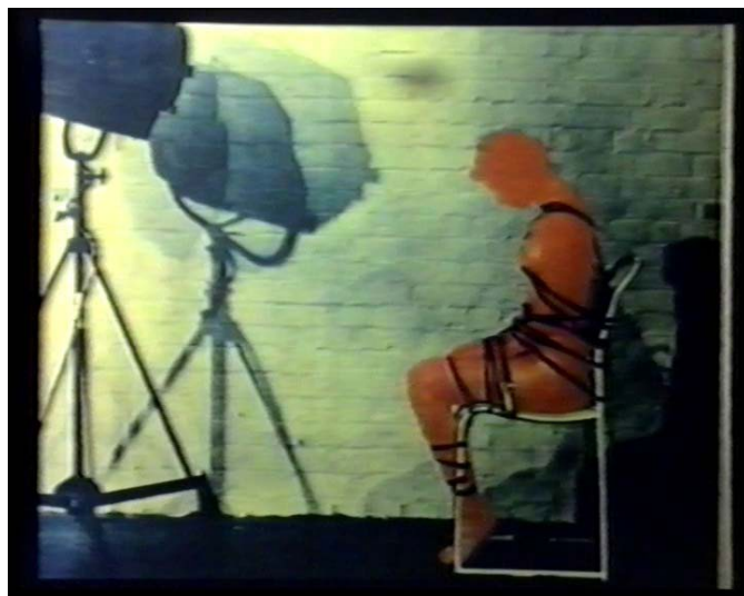
Elaine Shemilt, Women Soldiers , 1984, still from video.

work (and its destruction) constitutes a significant case study on early women artists' video art, testifying a different use and approach to the medium (compared to the contemporary male video artists and other women artists), a different idea of durée , documentation and future. It shows how video was instrumental to engage feminist themes, and how women artists' contribution was marginalised or even disappeared in the histories of early video art. Only future research with the support of women artists will open up the possibility of recovering women artists' experimentation otherwise lost to knowledge.