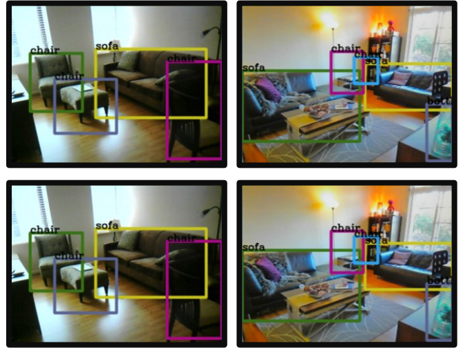
Fig. 1 Example detections taken from the test images

The proposed system was trained for 40 hours on an MSI GTX 1060 GPU with 4GB memory allocated to the training. 4 training checkpoints were saved to test the systems convergence rate and performance. These were at 29,000,