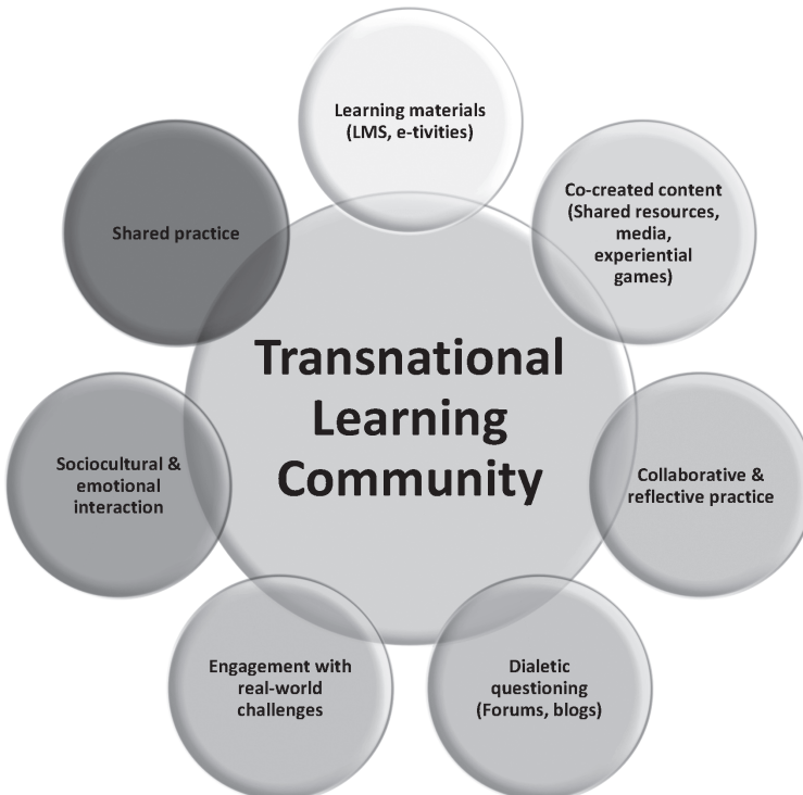
Essential Tools and Principles for EcoCOIL