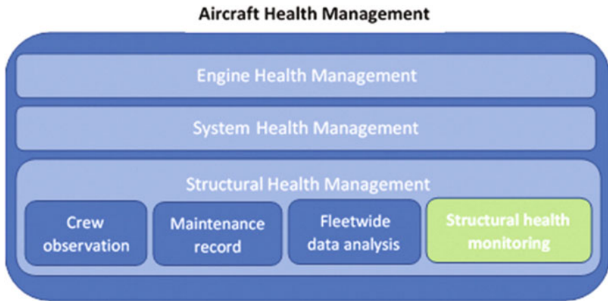
Fig. 2.1 Aircraft health management (SAE ARP6461 2013)