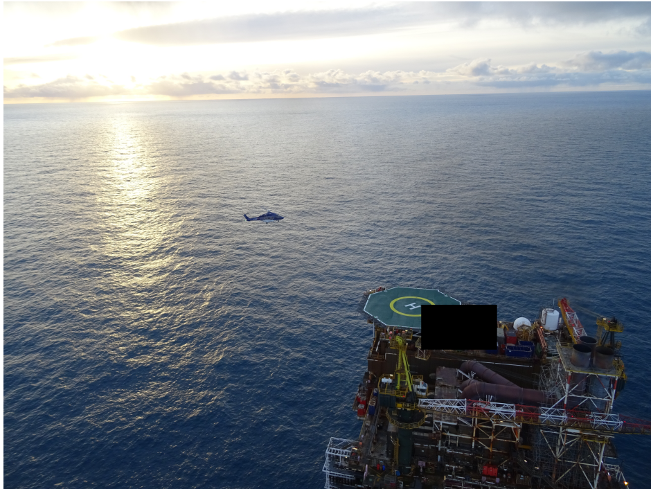
Figure 2: the view from one of the upper decks of the Point Delta installation. Only sea is visible in all directions.