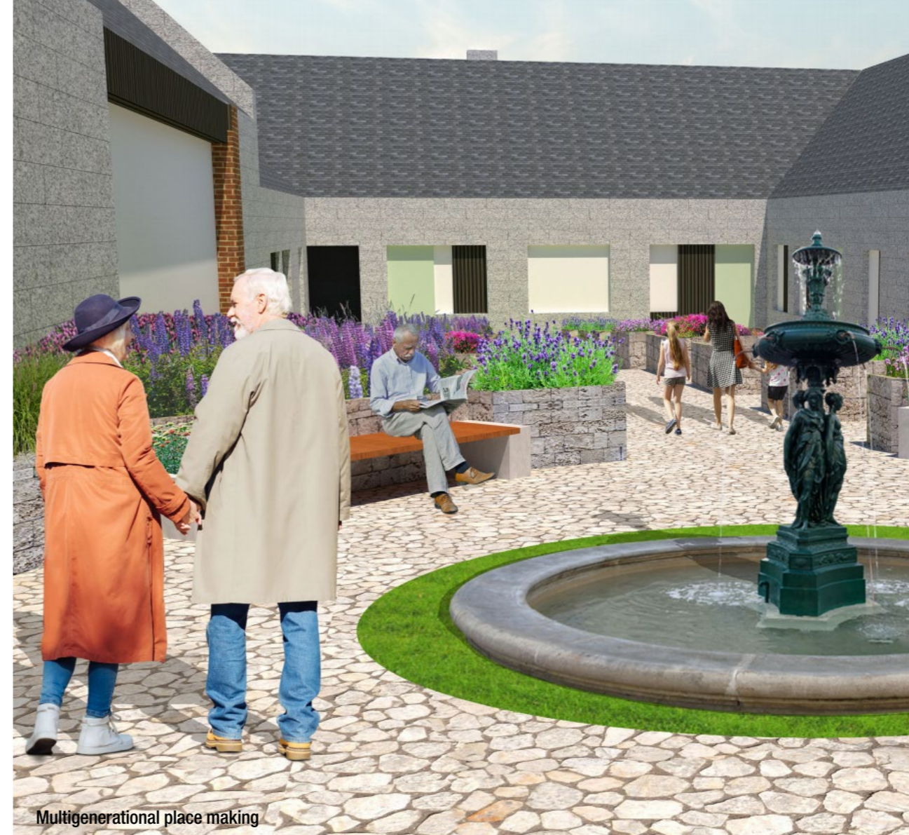
Multigenerational place making

These outdoor spaces have been conceived to enable older adults to engage in outdoor activities that complement intergenerational activities.