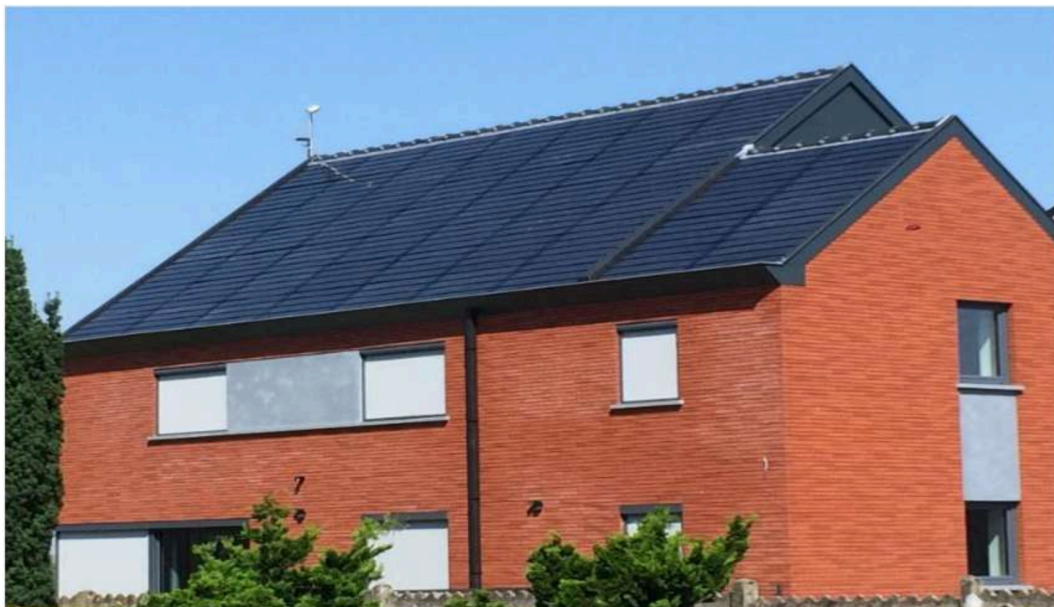
Figure 1: An example of BIPV roofing [10]

As the quest for sustainable buildings increases, especially after policies such as “Net Zero Energy Buildings” (NZEB) [11], BIPV promises to be a viable energy source that easily blends with modern architectural materials. The traditions and culture of a group of people cannot be substituted, hence the incorporation of significant and meaningful symbols in modern architectural materials could go a long way to encourage its adoption. For instance, if cladding, façade, or roofing materials should incorporate traditional symbols, there is a tendency that they may appeal to a certain calibre of people. It is evident that, the post-modern era has an interesting connection with antiquity. In other words, people are attracted to indigenous things, and may want to readopt them even in this modern era. Traditional symbols have lived for centuries, hence have great bearing on the ethos of a cultural group. Adopting these symbols in modern architecture has been championed by many researchers and designers [12], [3], [13].