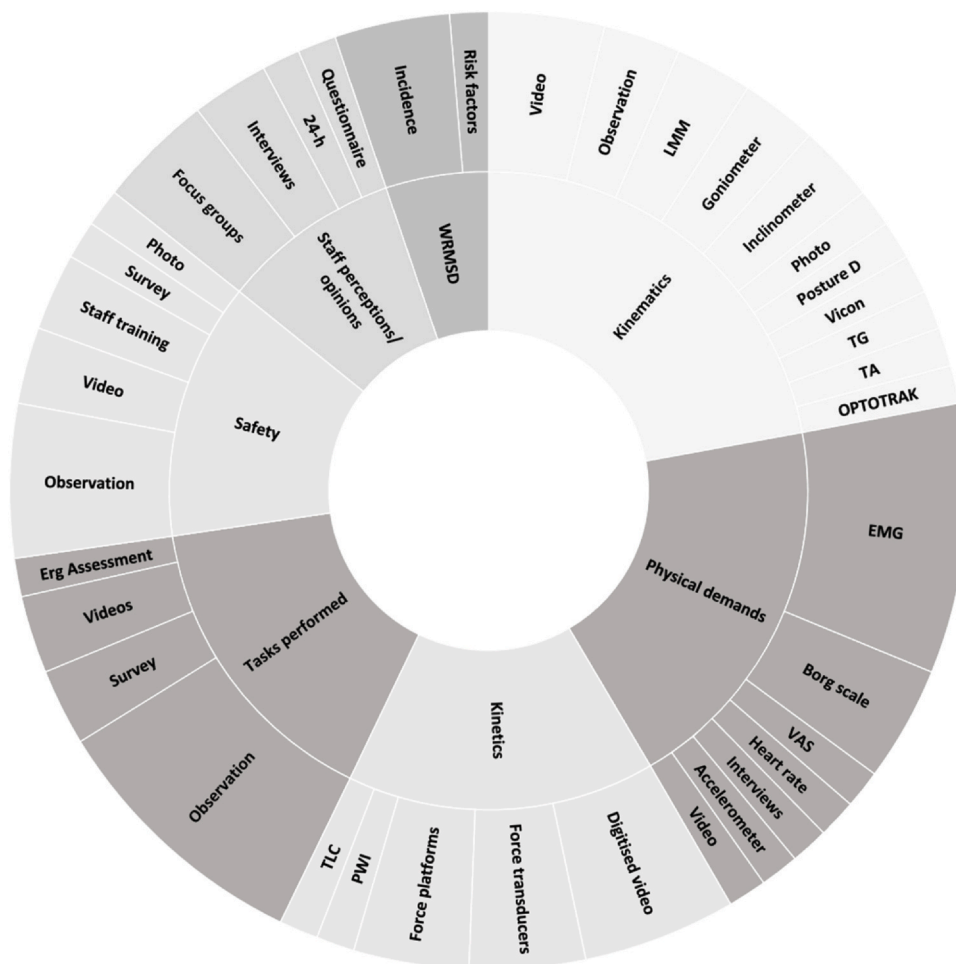
Fig. 2. Outcome measures from the primary research (n = 36) separated into measurement tools (outer ring) and the domain that they were used to collect data for (inner ring)(size of sections based on relative count for each measurement tool). Key: LMM – Lumbar motion monitor; Posture D – Posture dosimeter; TG – Tri-axial goniometer; TA – Tri-axial accelerometer; PWI – Physical workload index; TLC – Tri-axial load cells; Erg Assessment – Ergonomic assessment; 24-h – 24-h Survey.

including therapeutic handling, handler movement and handler perceptions is required to better establish the factors that increase risk of injury and to provide appropriate targets for interventions.