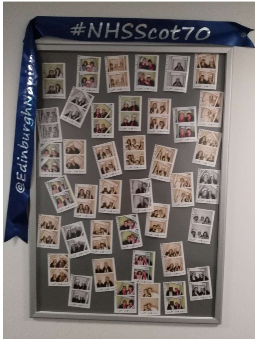
Figure 4: A selection of selfie photos take during the NHS 70 th anniversary celebrations at Edinburgh Napier University

hashtag #NHS70 and #NHSScot70 @EdinburghNapier to continue celebrating 70 years of nursing and midwifery in the NHS.