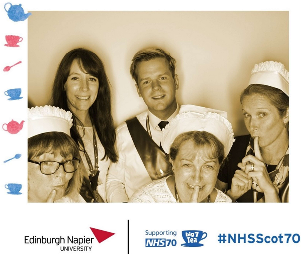
Figure 1: NHS 70 th celebrations organising committee selfie

our National Health Service (NHS) Scotland” aimed to raise awareness of the history and evolution of nursing and midwifery education, research and practice. In particular, we wanted to highlight the role of nurses and midwives within Scottish/UK society from the inception of the National Health Service (NHS) in 1948 to 2018.