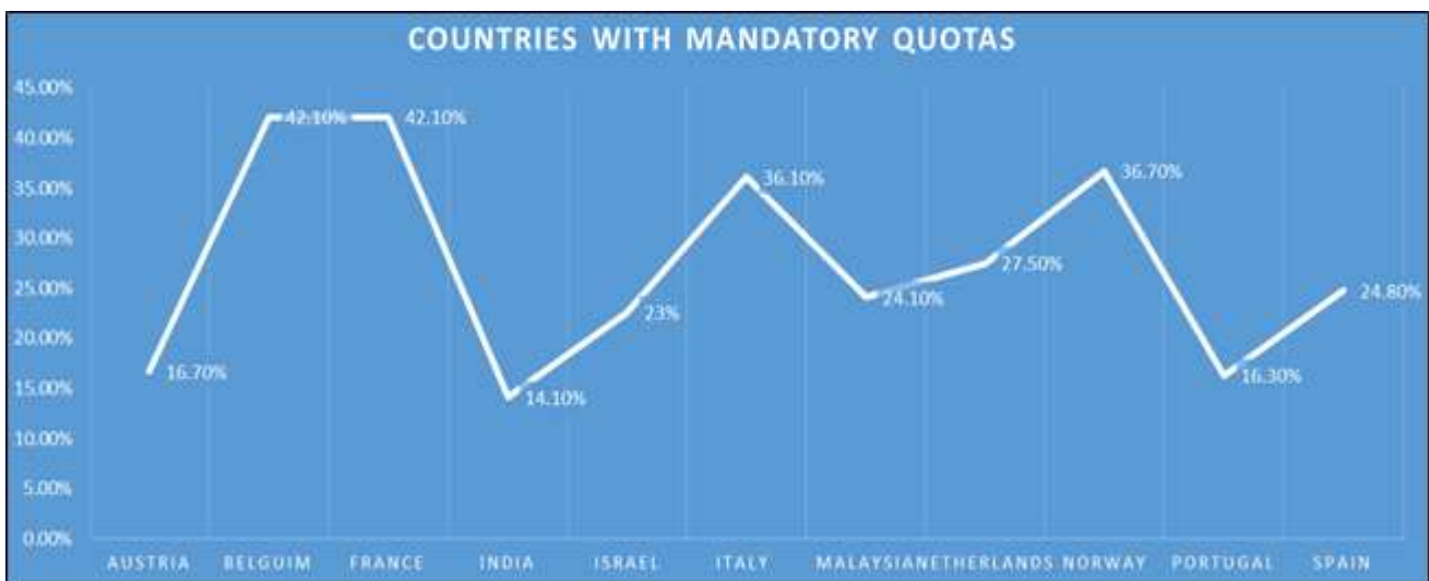
Chart 3: Graphical Illustration (by Researchers) of Countries with Mandatory Quotas, Restructured from the table in Egon Zehnder, 2018 [8] Global Board Diversity Tracker

Several countries have taken a drastic and active measures such as legally binding mandatory quotas, a law approved for mandating a specific percentage of gender in boardrooms, to address the lack of gender parity on corporate boards (Leszczynska, 2018) [12] . Through mandatory quotas, countries such as Austria, Belgium, France, India, Israel, Italy, Malaysia, Netherlands, Norway, Portugal and Spain have achieved significant progress, even though the tides have not fully turned, the trends are quite clear (Egon Zehnder, 2018) [8] .