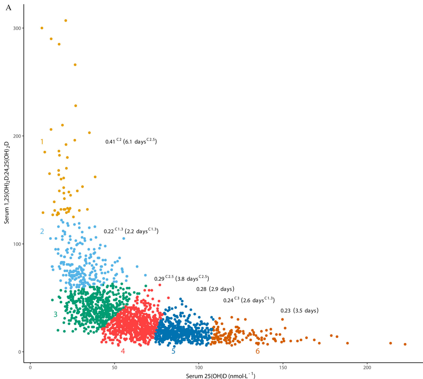
Fig. 1. Dynamic relationship between vitamin D metabolites and overuse injury. Participants (1 per filled circle) are categorized into one of six clusters (with each cluster a different color). Clusters are annotated with the proportion of participants injured during initial military training and the number of lost training days across all participants (injured or not). (A) Lower body overuse musculoskeletal injury. (B) Lower body bone stress injury. Cx,y, p < 0.05 versus cluster x and y. Comparisons of binary coding of lower body overuse musculoskeletal and bone stress injury were conducted using logistic regression with full data set and reference cluster rotated to assess all pairwise comparisons. Comparisons of the number of lost training days were conducted using tobit regression with full data set and reference cluster rotated to assess all pairwise comparisons.