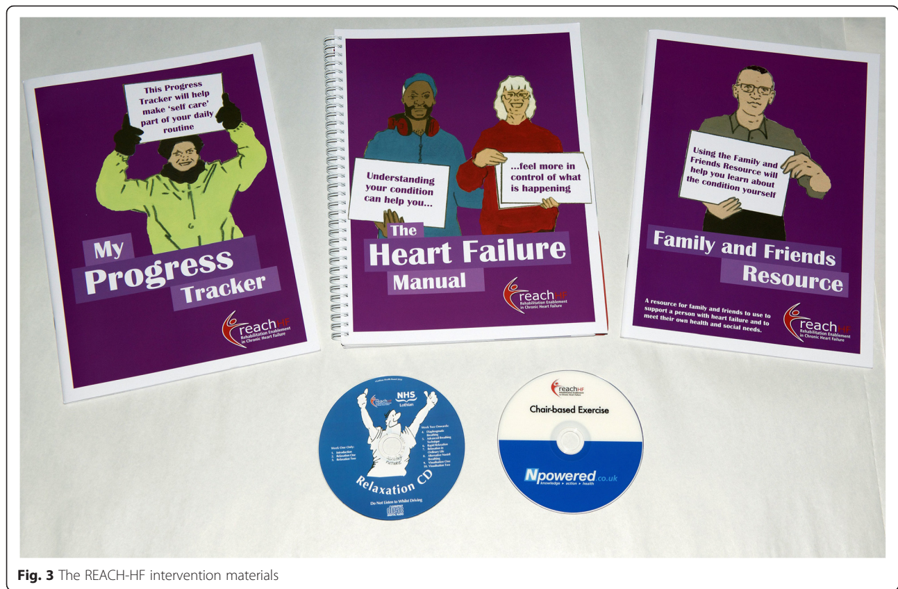
Fig. 3 The REACH-HF intervention materials

of patient backgrounds, knowledge levels and severity of heart failure.