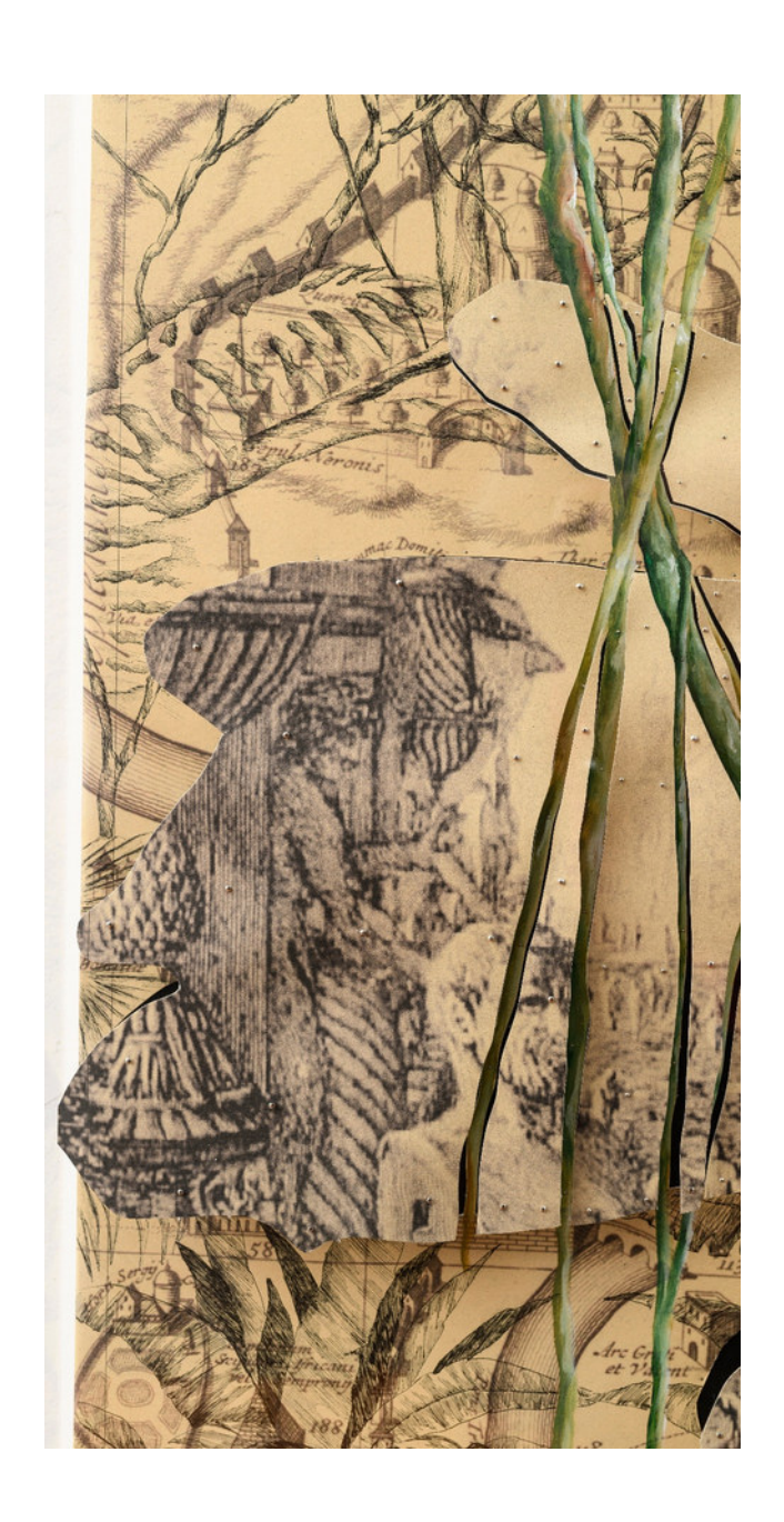
ABOVE & LEFT: Pietro Rufflo, Anthropocene 58, 2023 ink, oil and cutouts on paper laid on canvas, 124.5 x 158.5 cm