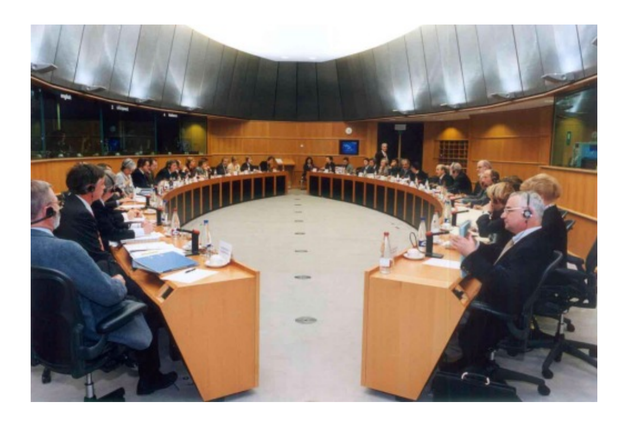
Figure 1: A full trilogue meeting

involving all-night sessions. The negotiators work on a four column document, with the positions of each of the institutions identified respectively in the first three columns, and a blank fourth column waiting to be completed to reflect the inter-institutional agreement reached in the trilogue meetings.