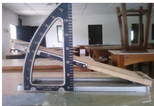
Figure 1: Tilting Table

Where: \mu is the Static Coefficient of Friction (dec), \theta is the angle of Inclination (degrees).