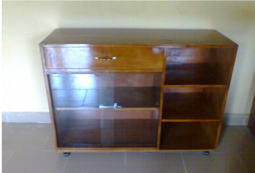
Plate 1: The Constructed Office cabinet.