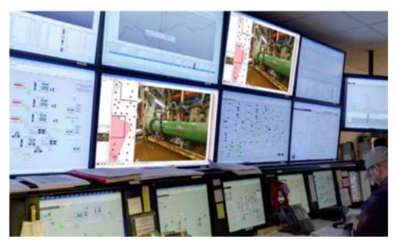
Figure 2: Asynchronous and distant collaboration using VAM in R2S

This research adopts a case study approach by appraising three examples of the application of VAM in the O&G industry so as to present learning opportunities for crossindustry knowledge transfer to construction and infrastructure projects. Case studies are appropriate where an in-depth knowledge of an individual example is more helpful than fleeting and superficial knowledge about a larger number of examples (Gerring 2006). The purpose of the study, at least in part, is to shed more light on the larger population by critically examining the phenomenon in one, or a few. It is preferred research strategy when the phenomenon and its context are not readily distinguishable and when a deeper understanding of practical issues on how things actually work is required (Denzin & Lincoln, 2011). Within this research, case studies provide the insight regarding VAM applicability within real-life context while they share some important characteristics (precision, quantification, objectivity and rigor). The first two projects cover the planning and actual delivery of projects whiles the third case study is chosen to demonstrate the utility of VAM for project team collaboration in a data hub and the shared approach was related to drawing out themes or findings which might be more readily transferred to construction.