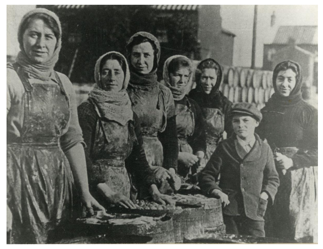
Figure 6: Fish Quines