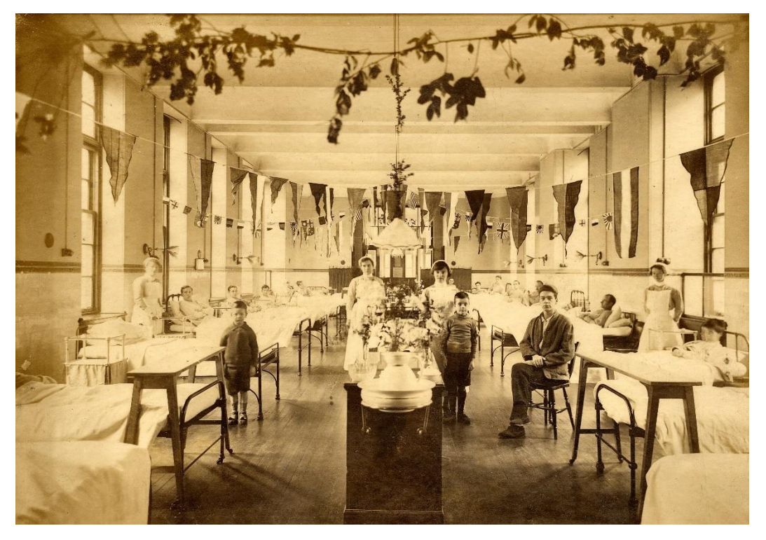
• User 1 – My mum told me that she snd [sic] and her brothers and sisters all boarded in the old Buckie Hospital building as children, until a house was found for the family at Enzie. This would be the late 1930's I think.

Another more obvious manifestation of the photographs being assimilated as part of users' personal cultural history was the use of local dialect (Doric) in post comments: