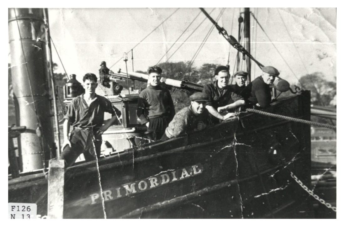
Figure 5: Crew of SD Primordial