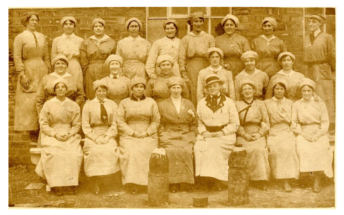
Figure 3: WW1 Hospital Auxiliary Staff – Portessie

For example, the comments made in connection with Figures 3 and 4 below demonstrate that users made the photographs part of their own personal cultural history through linking the past of previous generations with their own contemporary lives.