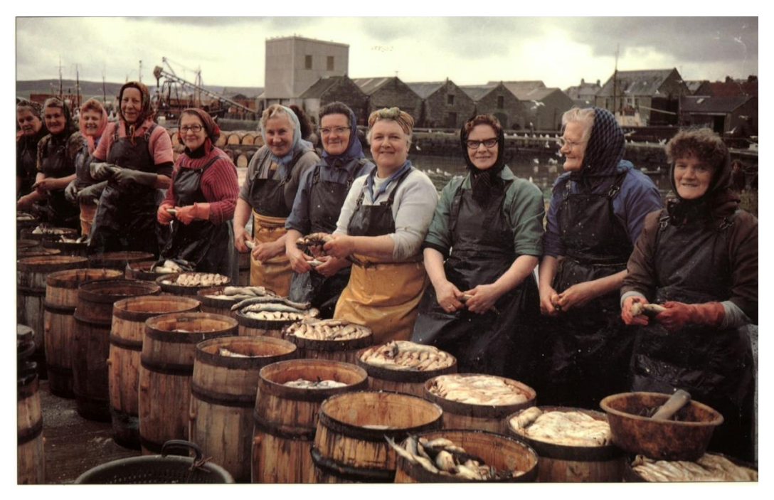
Figure 7: Gutting Quines