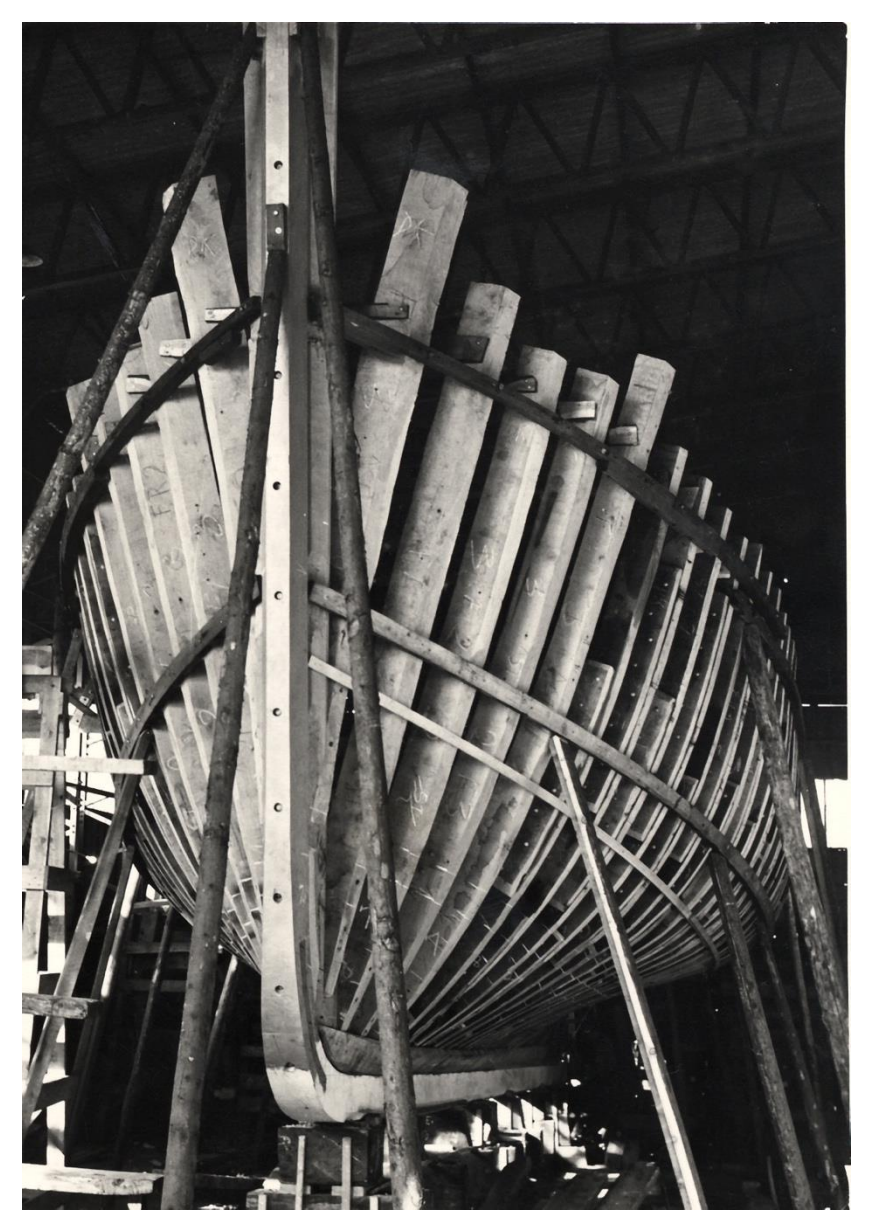
Figure 9: Building of the Heathery Brae