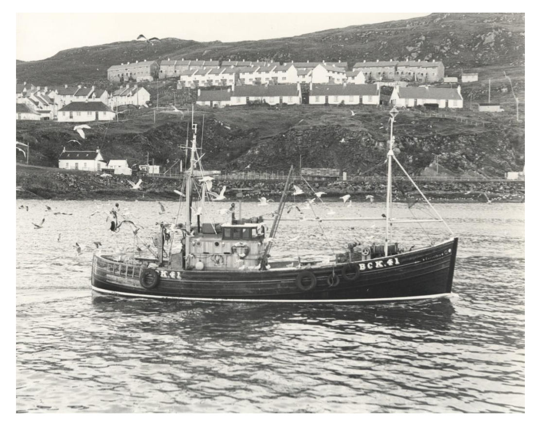
Figure 111: Carinthia BCK 41

The contrasting interpretations of the image content demonstrates how a single image can play a differing role in each individual's personal cultural memory. Again, the user reactions to this photograph also confirm the value of the research methods and the merit and value of photo elicitation as an approach.