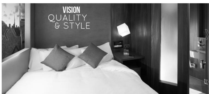
Figure 1. Hotel bedroom

The hotel is fitted out with several brand specific, ‘signature’ features including lighting, the in-room technology and luxurious ‘pod’ bathrooms. The client has recently been successful in obtaining a substantial amount of funding which it is hoped will lead to expansion of the brand. Indeed, the group are embarking on the planning stage for the next hotel which will be a 25 storey new build adjacent to New Street Station in central Birmingham.