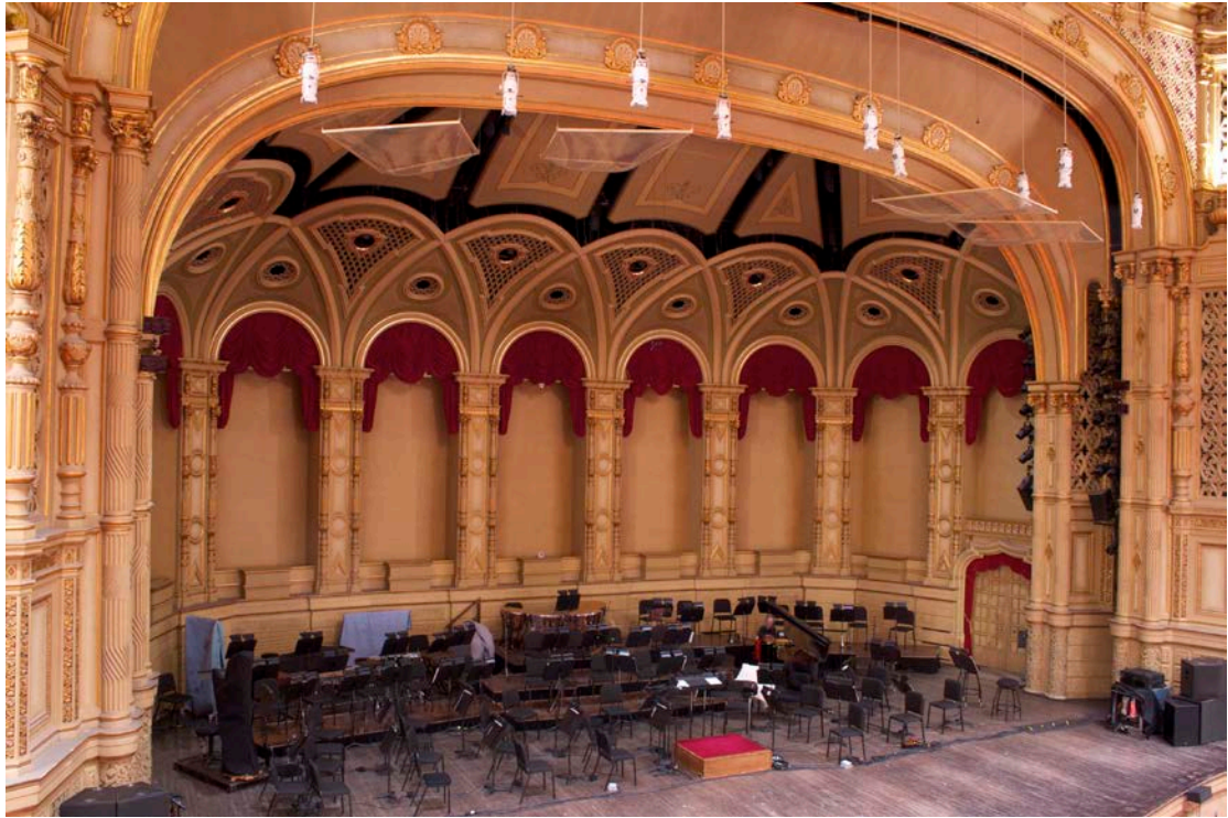
Figure 5: Stage area, including acoustic curved panels at the rear of the stage