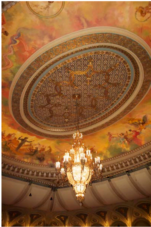
Figure 6: Re-painted suspended auditorium ceiling