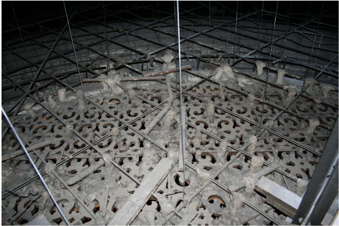
Figure 3: plaster on lath (detail shows suspended auditorium ceiling)