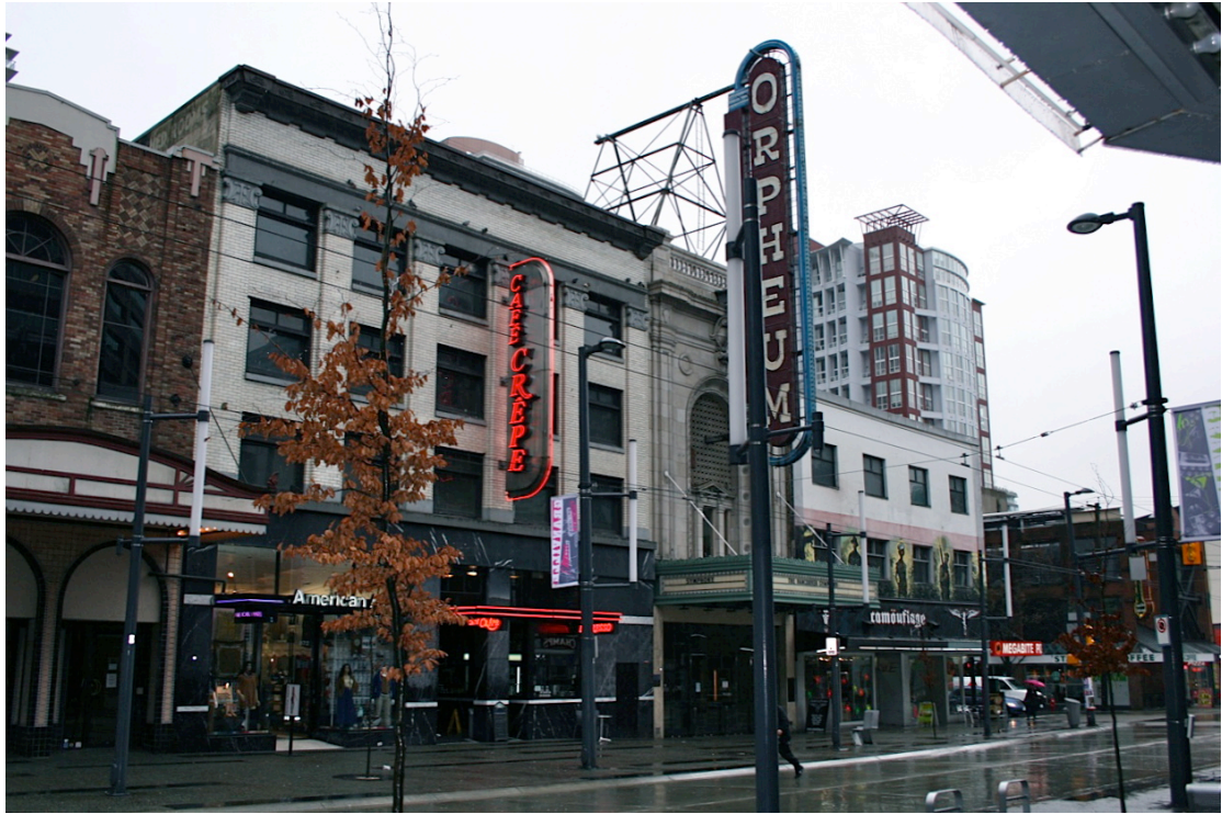
Figure 8: Granville Street frontage. Note the narrow original opening underneath the sign.