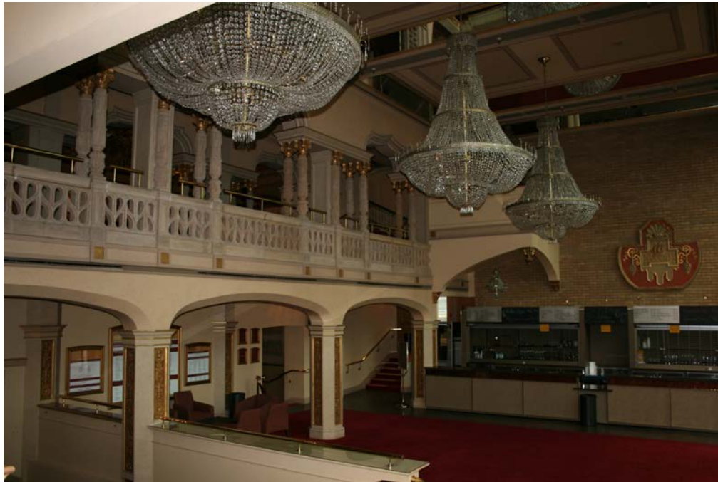
Figure 1: 'stone' pillars in the foyer area