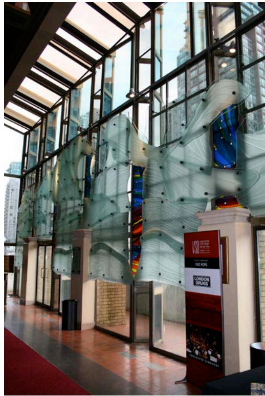
Figure 7: Newly constructed public entrance area