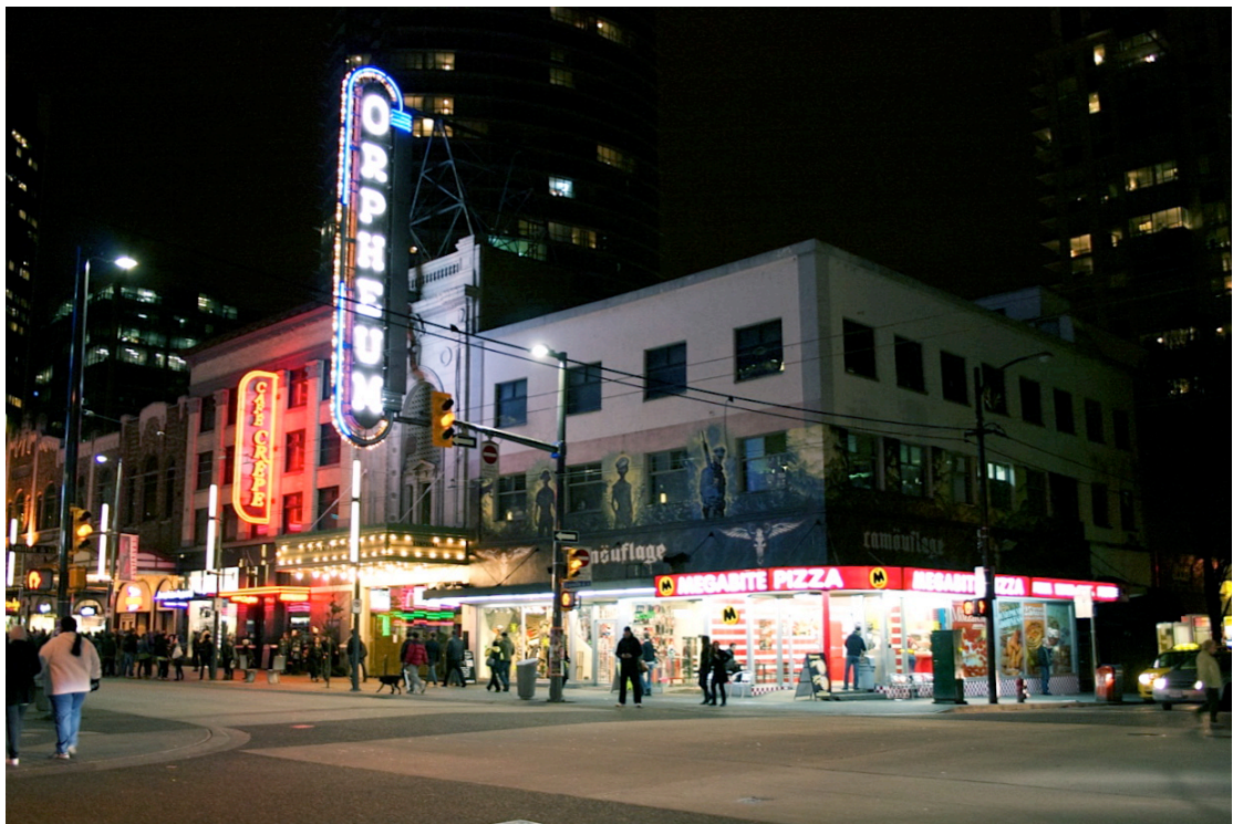
Figure 9: Alternate view of Granville Street (illustrating lighting, and narrow original frontage)