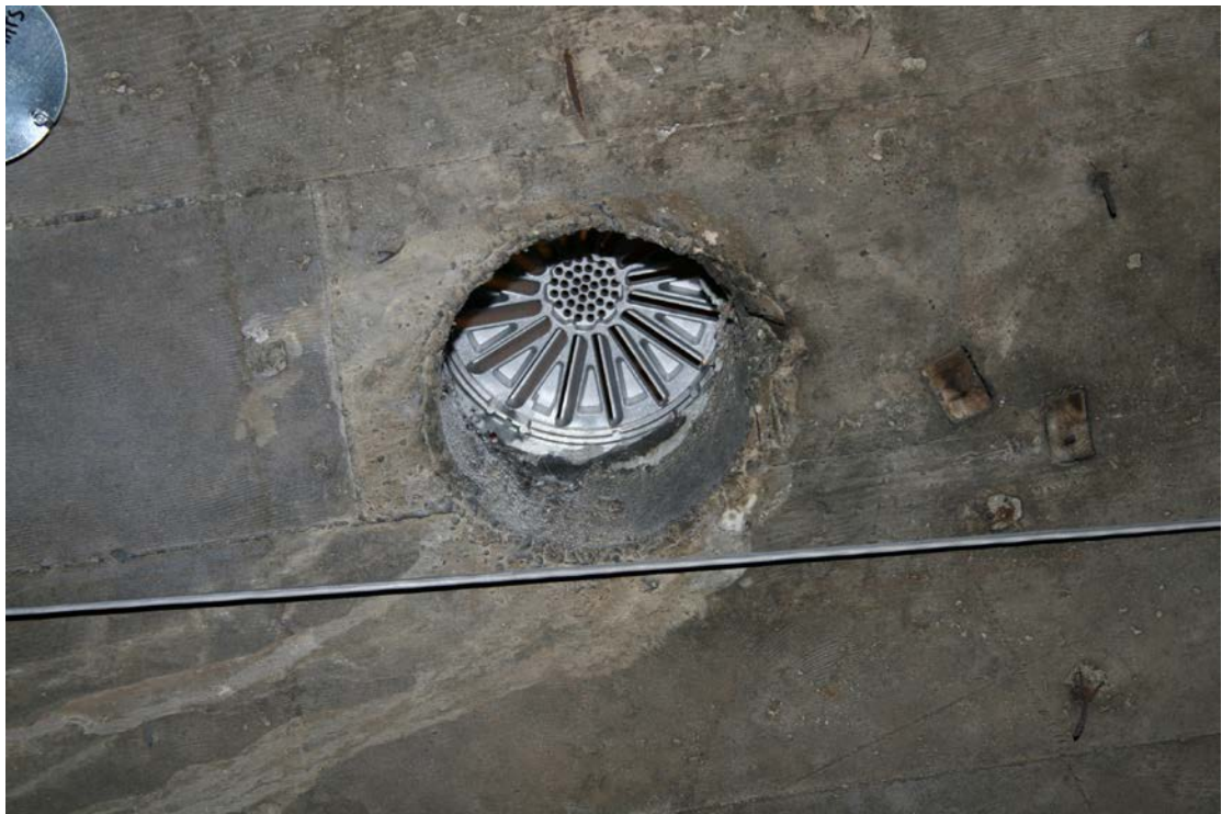
Figure 4: air vent in basement, leading to under-seat ventilation