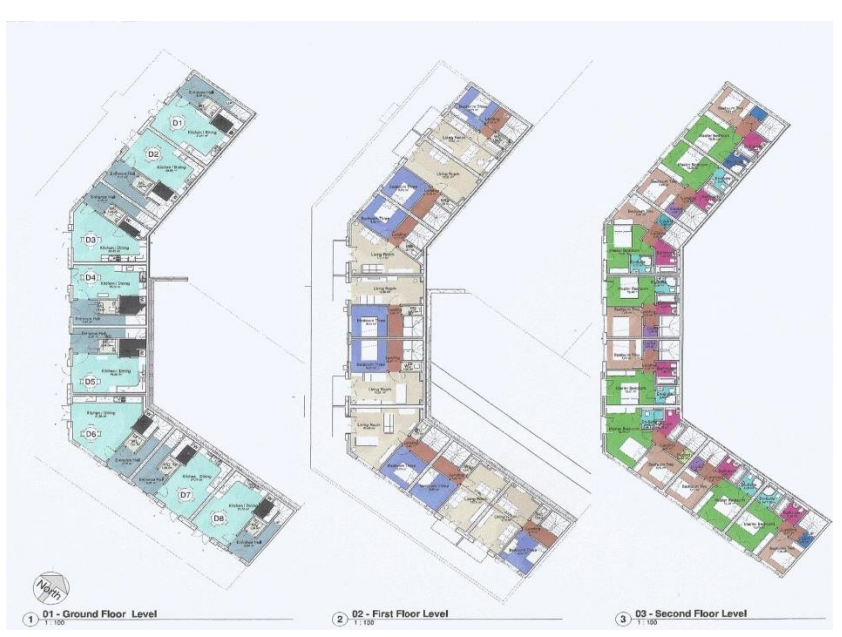
Figure 1. Plan layout of the new townhouses design