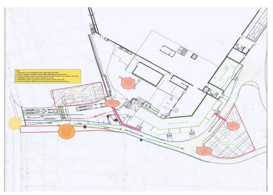
Figure 2. Site access plan showing site access constraints with the food store located at the top and the park at the bottom.

The contractors also elected to install a beam and block floor which brings the benefits referred to above but also has the advantage of being prefabricated off site, again, thereby reducing pressure on site to accommodate deliveries.