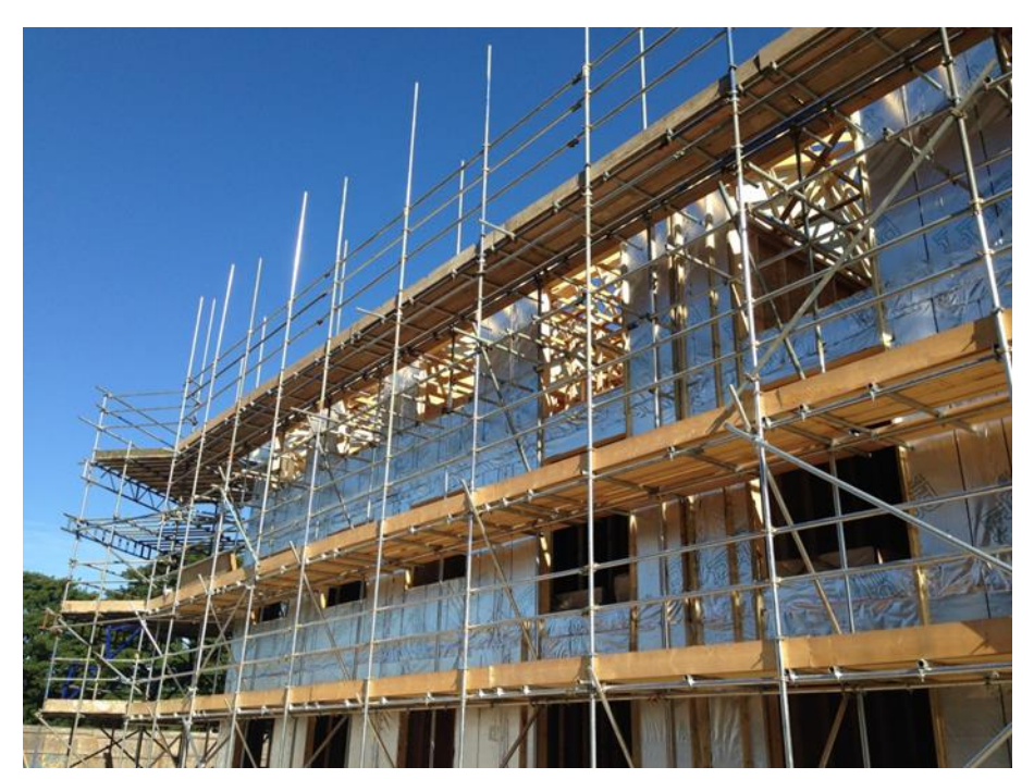
Figure 1. Bloc D in construction