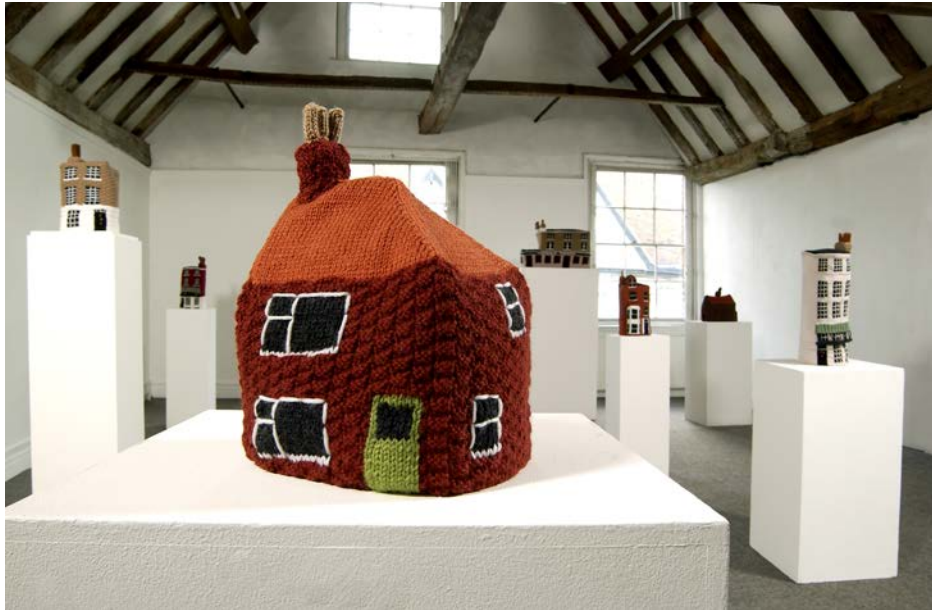
Knitted Homes of Crime 2002, Photo: Douglas Atfield

In 'Knitted Homes of Crimes' Robins uses knitting as a medium to address crimes by women in a soft yet provocative manner. Through knitting she disrupts our assumptions of the home as a place of safety and domesticity.