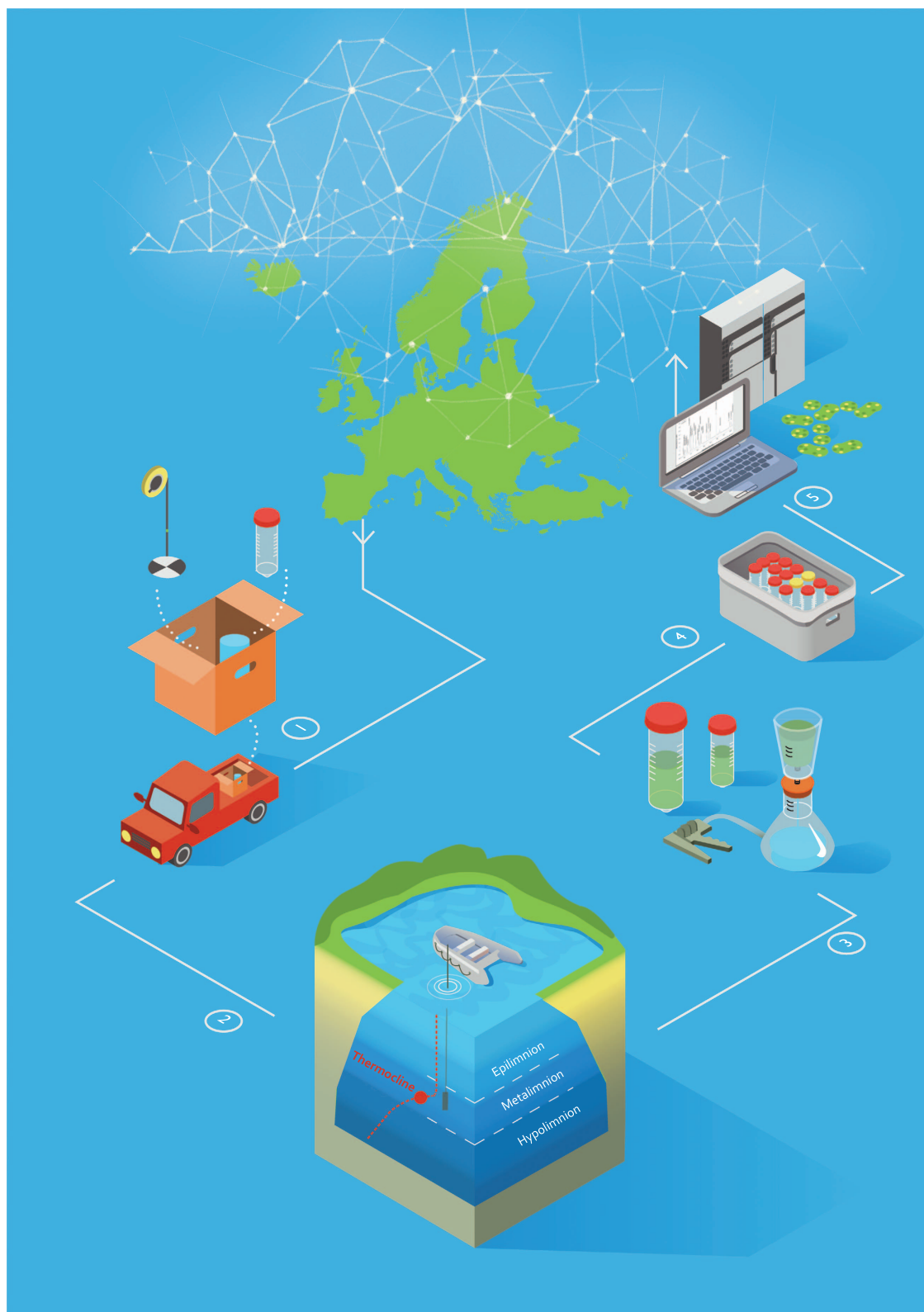
Figure 2. Schematic overview of the European Multi Lake Survey (EMLS). CyanoCOST and NETLAKE members performed the sampling routine by: 1. Preparing the sampling material to meet the standardized procedures 2. Accessing the lake site and acquiring integrated water samples from the bottom of the thermocline up to the water surface 3. Processing and preserving the water samples based on requirements for subsequent analysis 4. Shipping samples to a central receiving laboratory 5. Analysing nutrient, pigment and toxin concentrations in dedicated laboratories. After quality control checks and data integration the dataset returns to the European network and becomes publically available for further research. Created by Sarah O’Leary and Eilish Beirne.