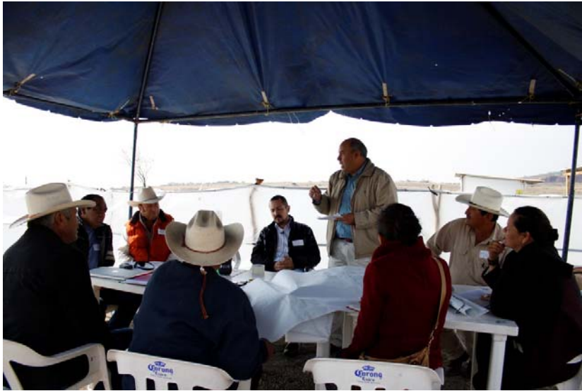
Fig 1 “What do we need to do?”

All of the participants were animated and totally involved in the process. Not only was the workshop productive in terms of the data gathered, but new ideas emerged for other potential diversification opportunities. In many ways, this is an example of how the ‘context’ of research can be an important opportunity for entrepreneurial learning (Welter, F. 2011).