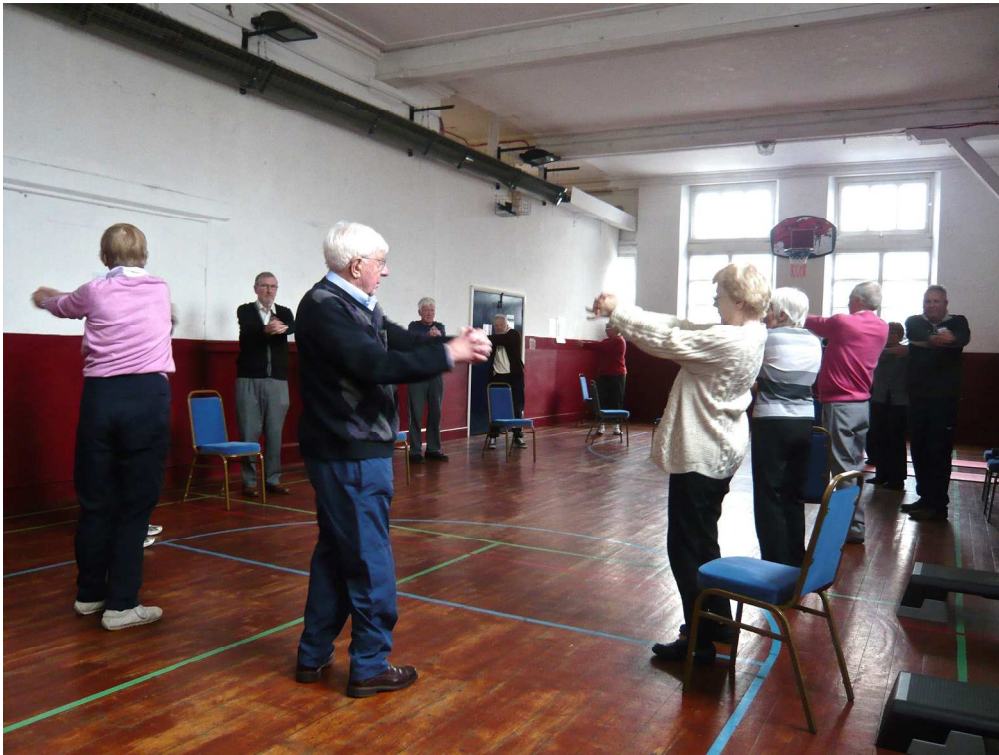
Figure 4: Posture and balance class