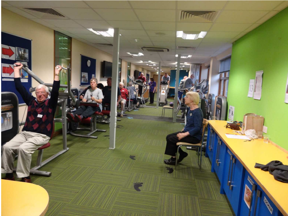
Figure 3: Circuit class 203x152mm (300 x 300 DPI)