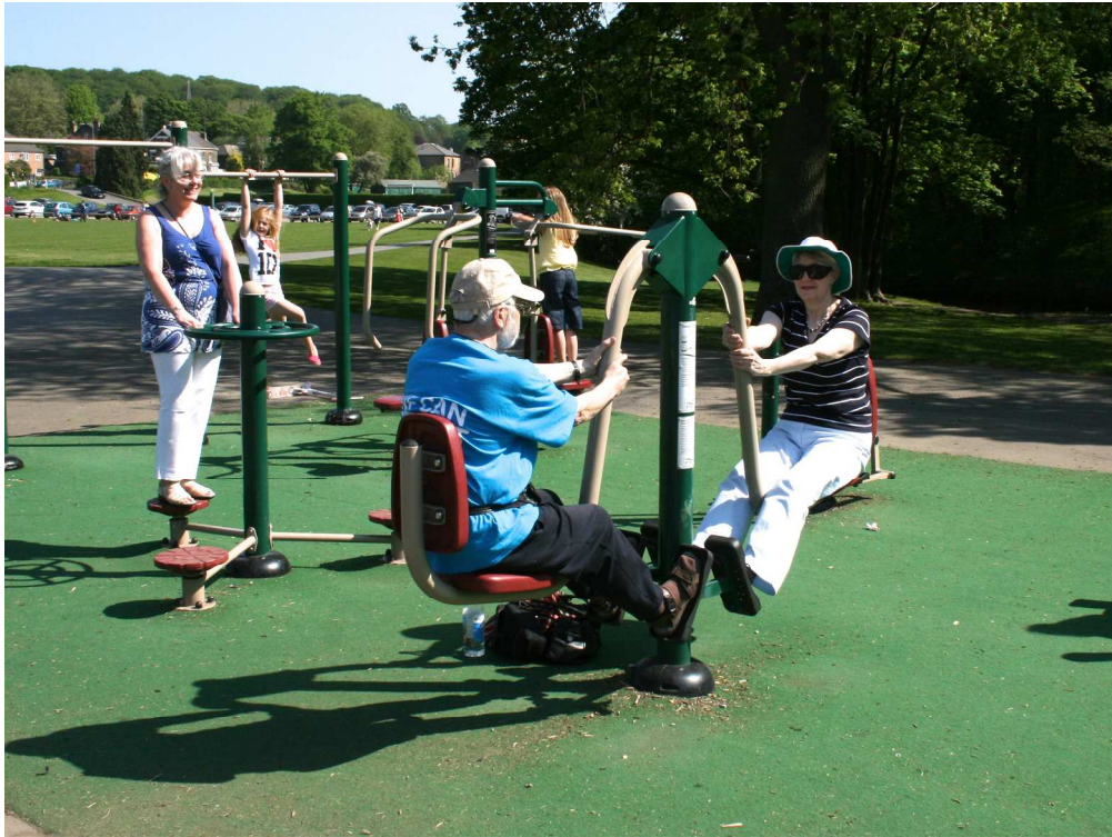
Figure 6: Green gym - pre monthly walk