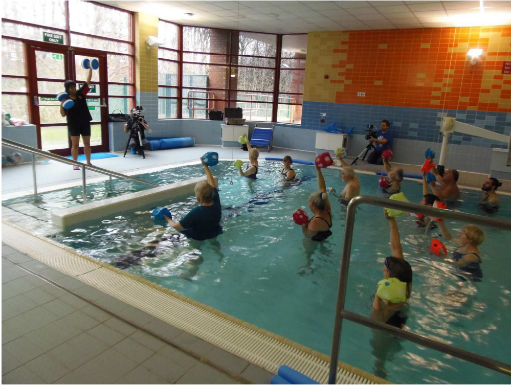
Figure 5: Aquarobics and hydrotherapy