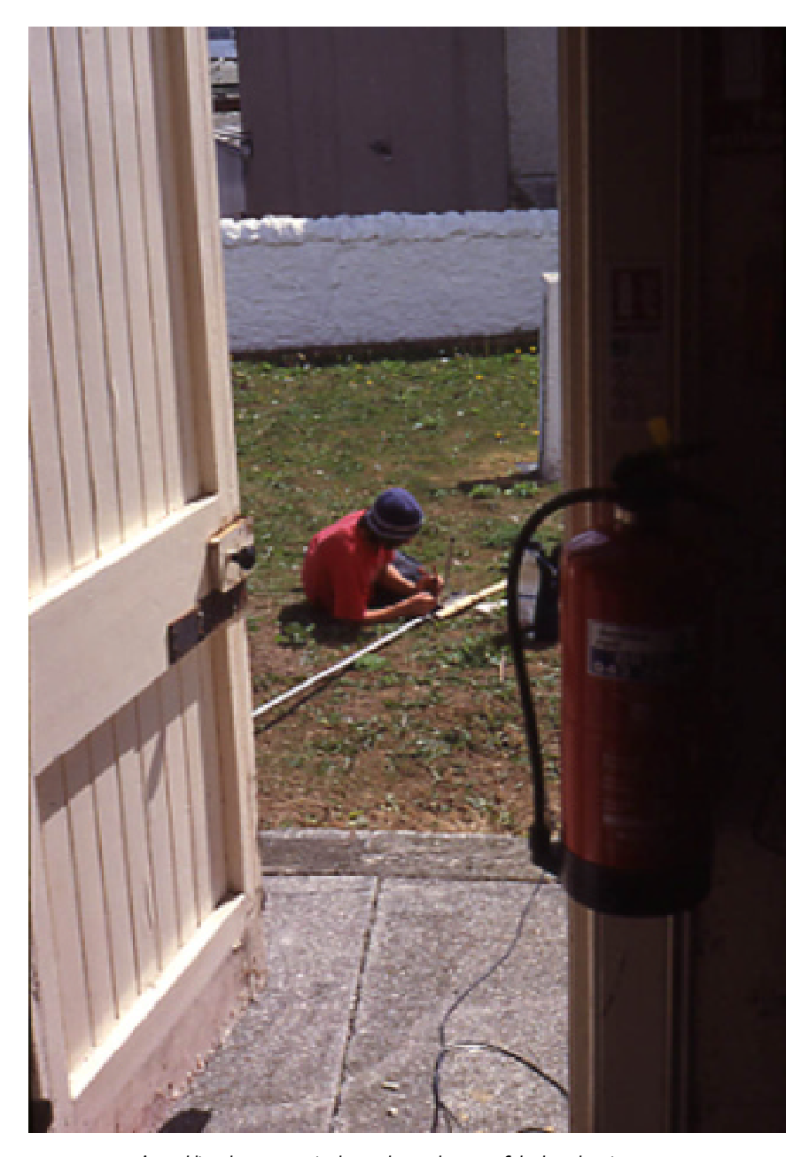
Assembling the antenna in the garden to the rear of the broadcasting room.