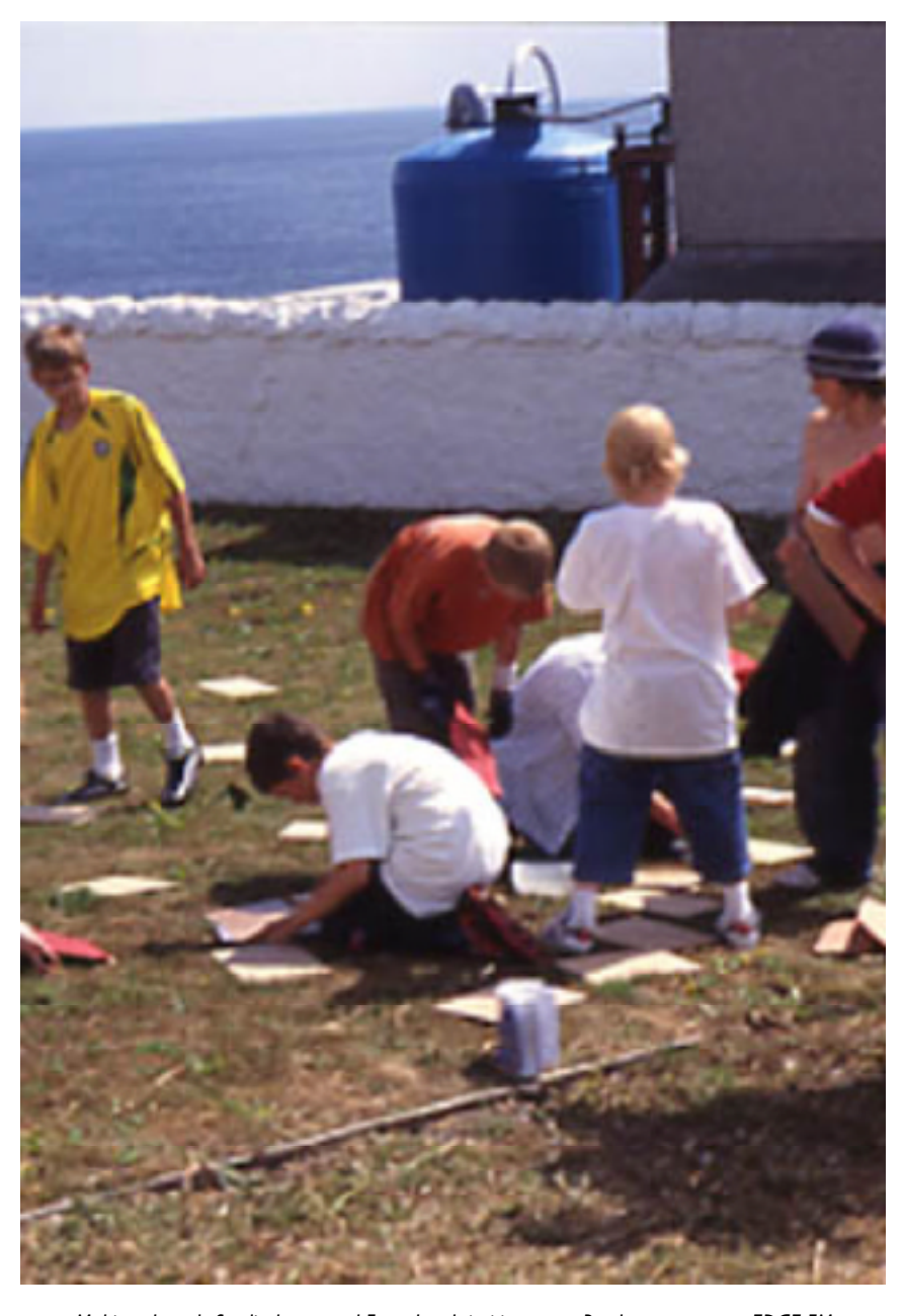
Making placards for display around Fraserburgh inviting young Brochers to come to EDGE FM headquarters and make a recording.