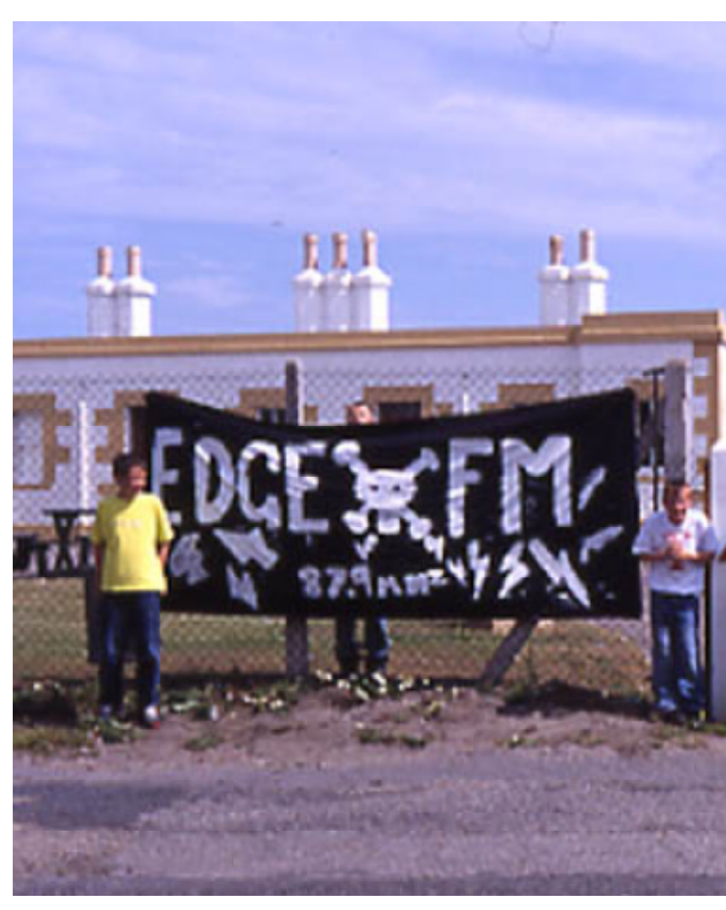
Outside EDGE FM headquarters on the first day of recording