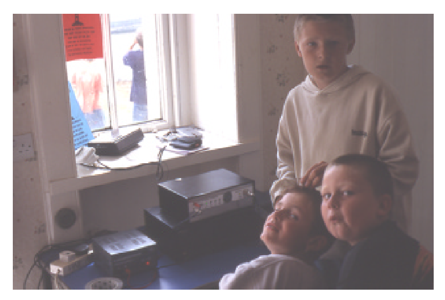
The transmission equipment in the broadcasting room of EDGE FM headquarters.