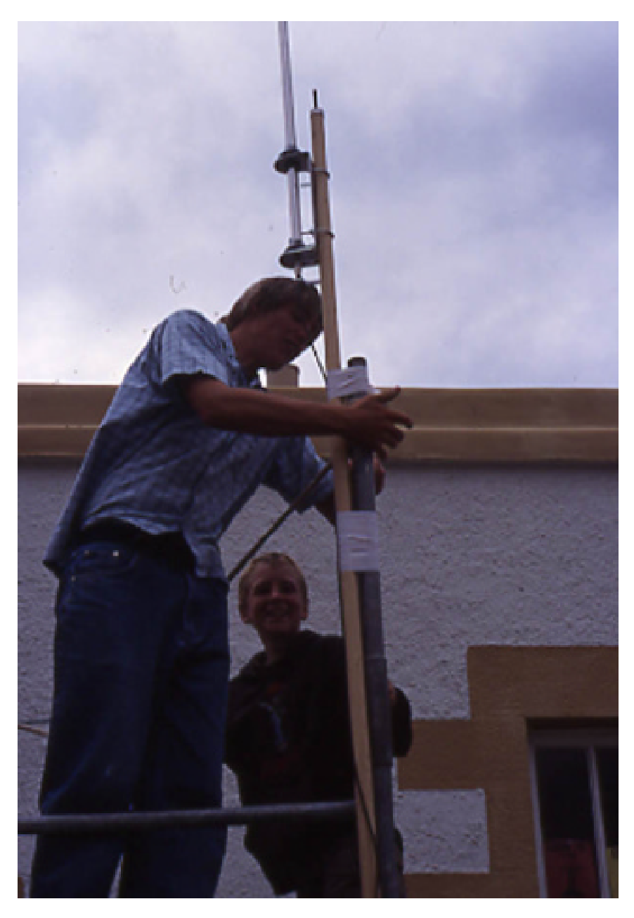
Erecting the antenna prior to the first test transmission.