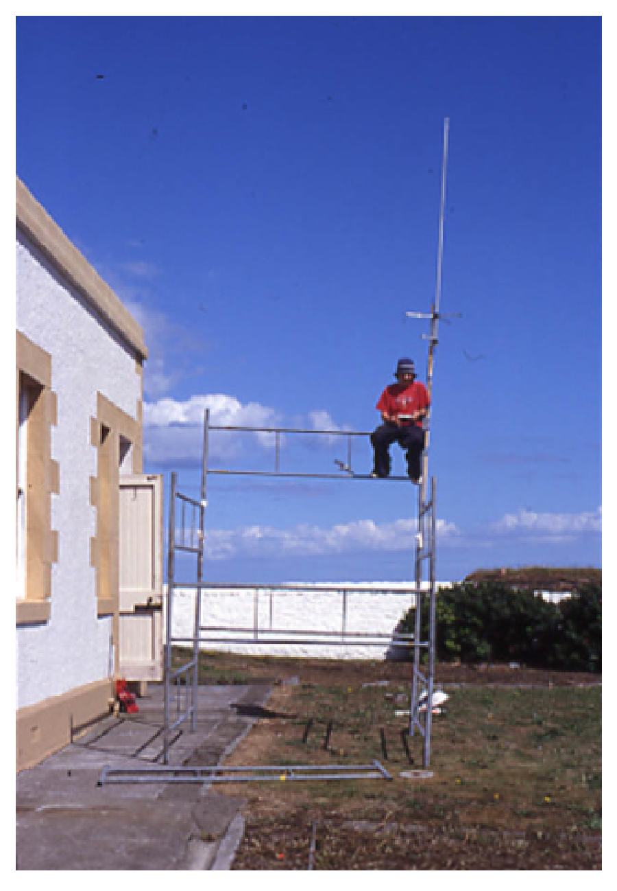
Testing the transmission equipment.