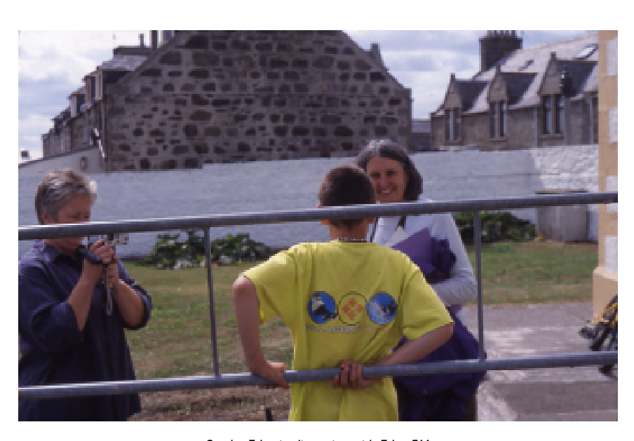
On the Edge in discussion with Edge FM.