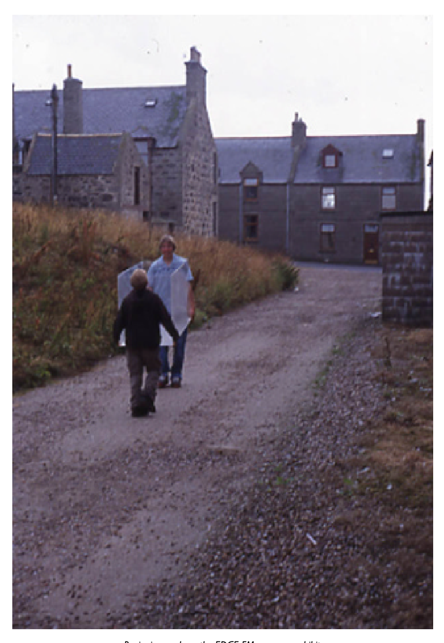
Beginning work on the EDGE FM museum exhibit.