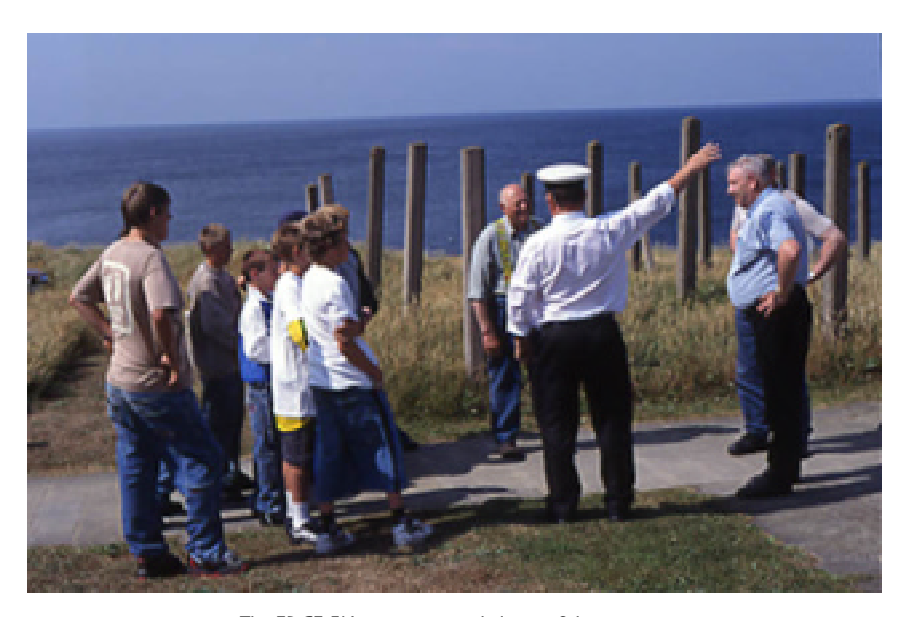
The EDGE FM team on a guided tour of the museum.

As such Edge FM became a tool for the creation of a vision of the lives and surroundings of the people who were involved in the project. The chance to be recorded and to send messages to others was often used as an opportunity to complain. These complaints, largely about the lack of provision of facilities, were not isolated however, but formed part of a larger positive argument for a progressive vision of the town. Complaints about the lack of a 'decent skateboard park' for example, easily viewed as pushing a narrow and overly specific agenda, began to emerge as a part of a widely-held vision of Fraserburgh as centre for sporting excellence which drew on its natural resource of ideal surfing waves to build an extensive sustainable economic and cultural infrastructure which would do everything that town councils