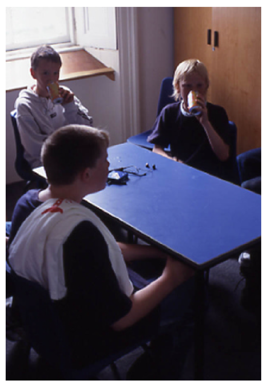
Recording at EDGE FM headquarters.