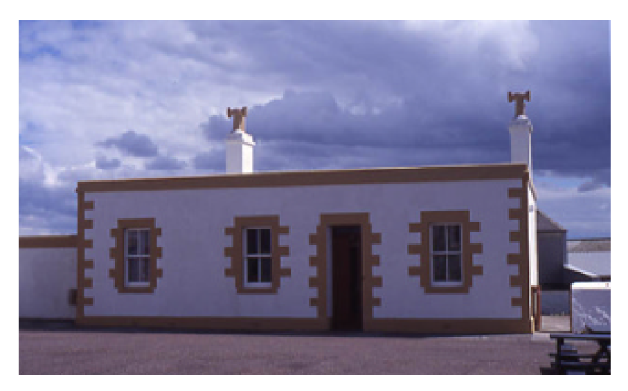
EDGE FM headquarters at the lighthouse keeper's cottages.

dream of; get young people interested in sport, create a facility which attracted people from out with the town, and re-brand a town which, like so many others, has had its image tarnished by economic decline. Providing a simple tool for communication with a broad remit inevitably meant that a variety of different approaches were taken by both the interviewers and interviewees, but almost all used the chance to transmit as a corrective tool. Many chose to point out the qualities of their local culture which have been often overlooked by the national media bent on playing up drug problems, many chose to protest about what they saw as a lack of support by people who have power within the town and others to promote a positive vision of Fraserburgh in the future. Every voice operated with one of a number of different perceived audiences, with many perceiving the rest of the country as the audience, others seeing the town councillors and local establishment as the audience. As such the project became an attempted reclamation of the ownership of control over the vision of the town. The perceived audience was seen as having a vision of Fraserburgh, of the young Brochers home which required correction. As the process of correction gained momentum, through discussion, it developed into the creation of a new vision where the set of corrections became a cohesive agenda.