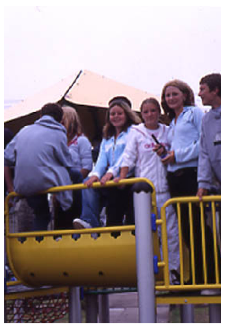
Recording on location at the 'Granda Swings'.