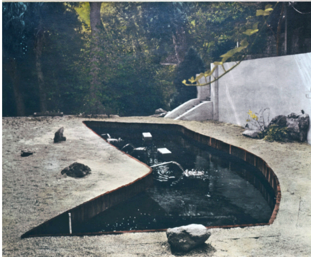
Fig 2 and 3 Excerpt from The Lagoon Cycle (1976-86): The Third Lagoon The House of Crabs p1&2