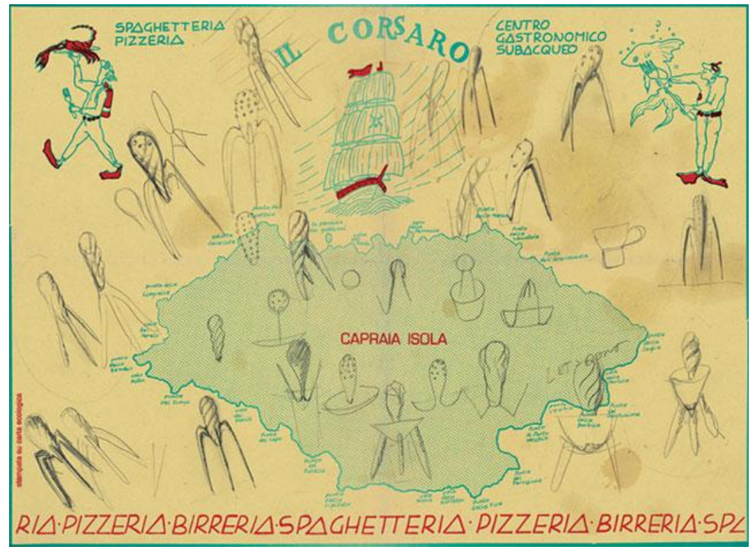
Figure 2 . Sketches on service napkin, Juicy Salif, the lemon squeezer (Carmel-Arthur, 1999).