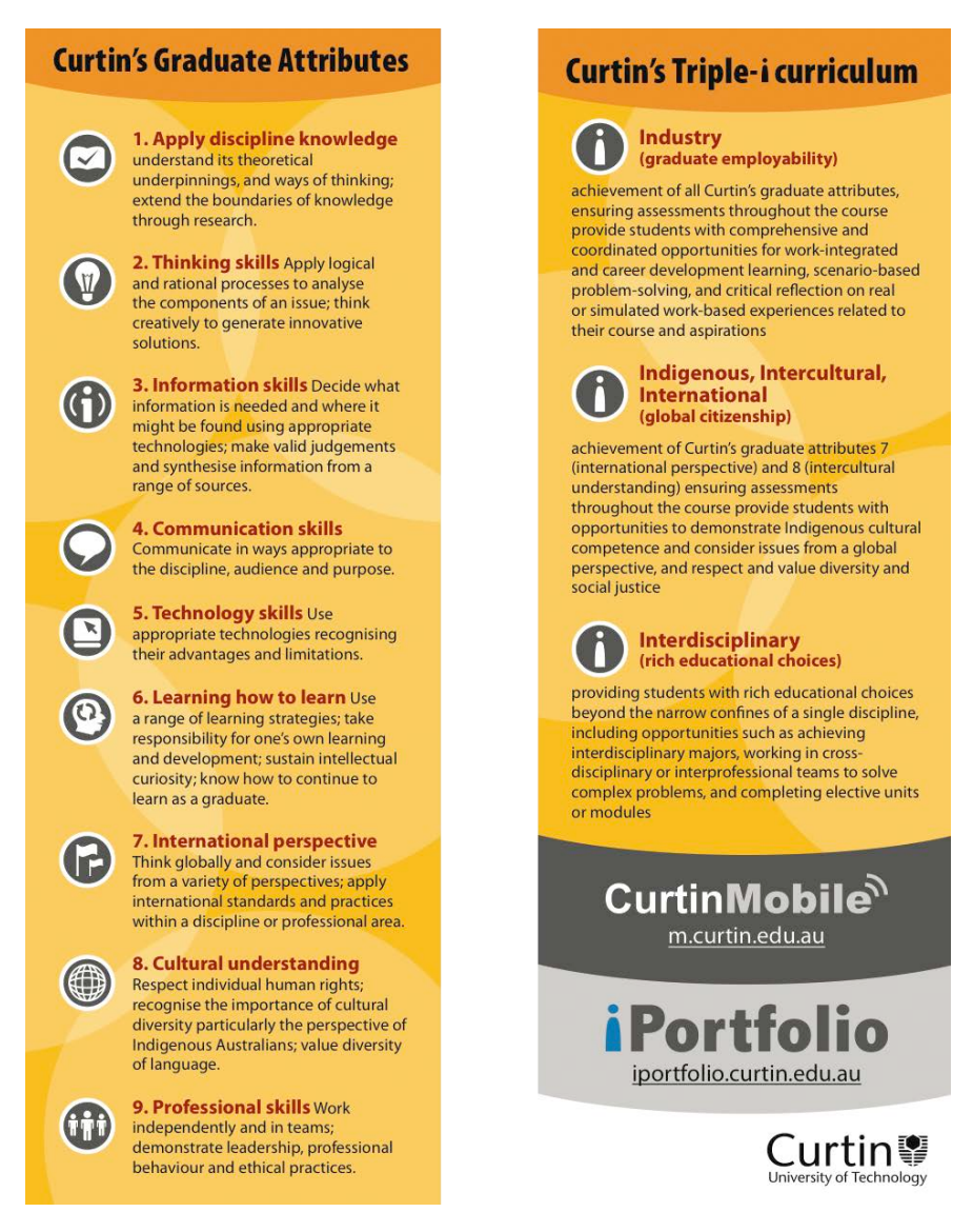
Figure 1. Bookmark describing Curtin University's Graduate Attributes and the Triple-i curriculum