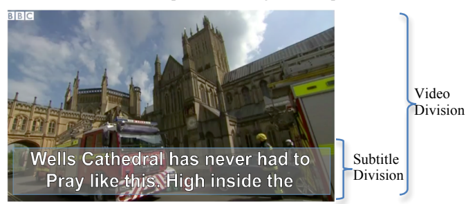
Figure 1 - The HTML Video player

Our example implementation provides an enhanced HTML5 """" video player, using JavaScript to display the correct subtitle in time with the video and dynamically re-block the subtitles as a response to user interaction. The video player is embedded into an HTML page using two divisions. The first is contains an HTML5 video object and a second provides a container for the current subtitle. It floats on top of the video player using CSS for rendering style (For example typeface and colour) and position (defined by a polygon), as shown"" Figure 1. Other functionality """ such as other ability to reposition the subtitle division above or below the video are also provided using JavaScript.