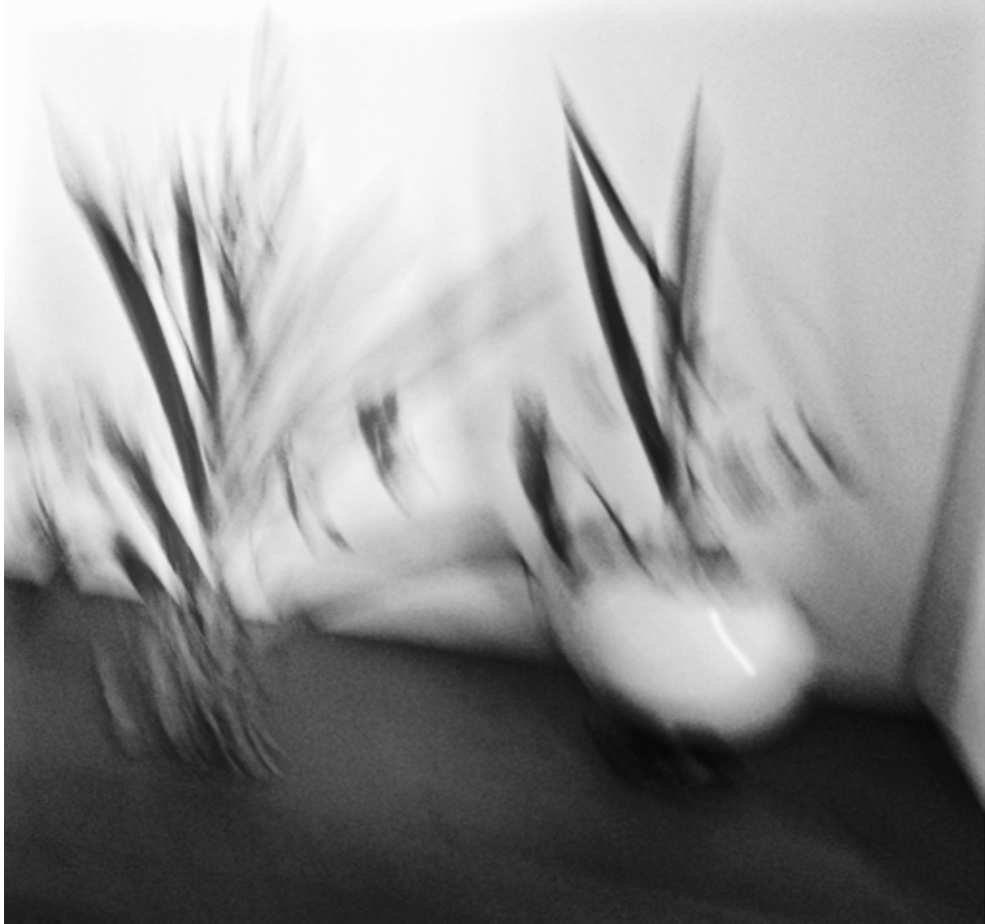
'The blind spot' 2 (Inner Experience, III).