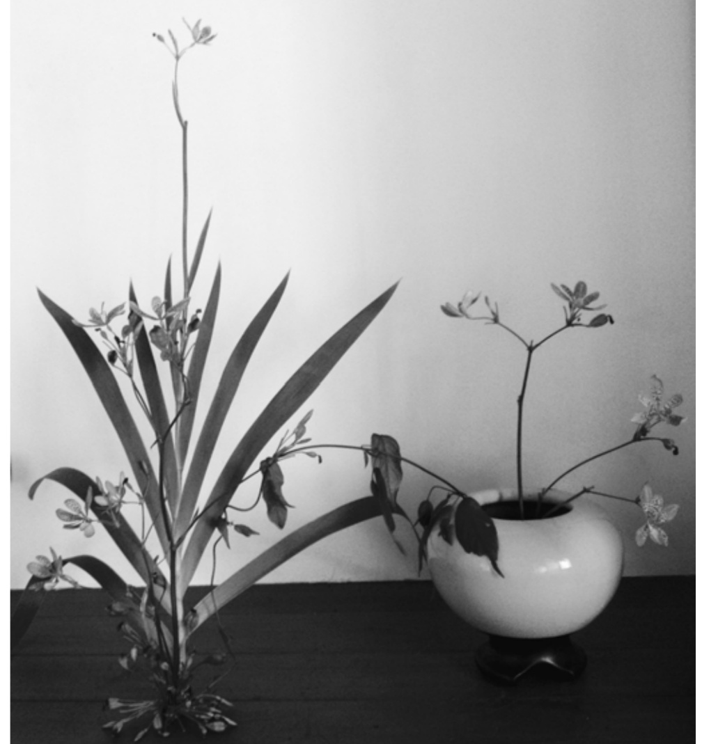
'your life is not limited to that ungraspable inner streaming; it streams to the outside as well and opens itself incessantly to what flows out or surges forth towards it [...]

'I am and you are, in the vast flow of things, only a stopping-point, favouring a resurgence' (Inner Experience, 94-5).