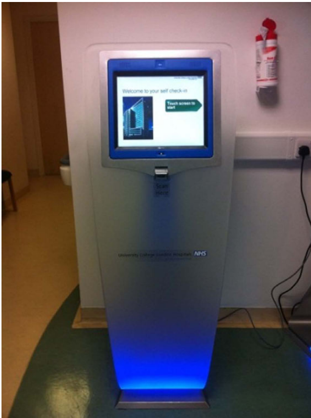
Figure 1 Self-service check-in kiosk.

relation to patients managing their own long-term conditions, for example, diabetes, and anti-coagulant medication: