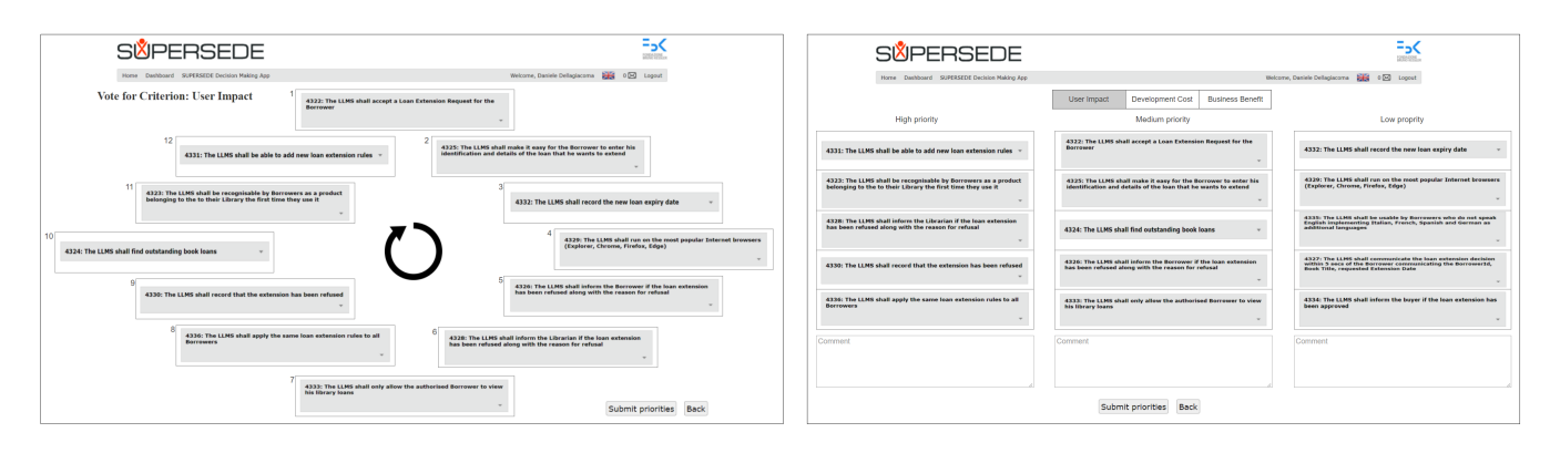
Fig. 4. Mockup generated by applying DTA: Clock-like requirement prioritization (left). Priority-list by criterion (right).

previous and the new version of the DMGame. In this case, the engagement is provided through gamification. The third section aims at comparing the functions of the previous and the new version of the DMGame. Specifically, the clock-like and priority-lists prioritization methods implemented in the new version of the tool. Finally, the last section includes open questions about strengths, weaknesses, and improvements of the revised DMGame.