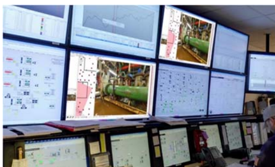
Figure 2: Asynchronous and distant collaboration using VAM in R2S