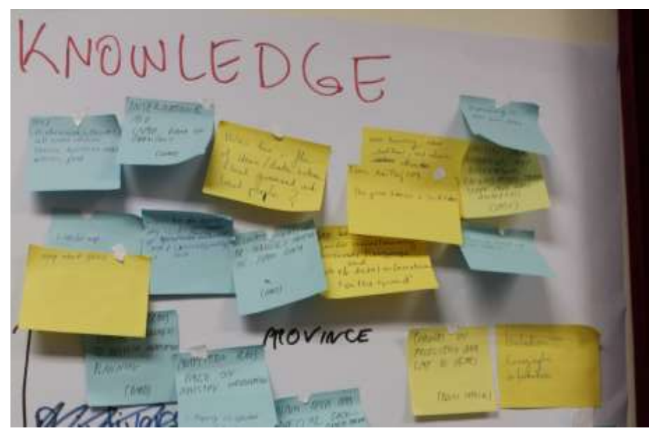
Figure S4: grounded data analysis outputs