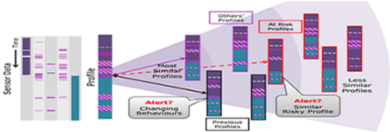
Figure 2: CBR Approach to Identifying 'Risky' Behaviours

sensor is activated during an activity timespan. The solution is a single class label, namely the labelled activity.