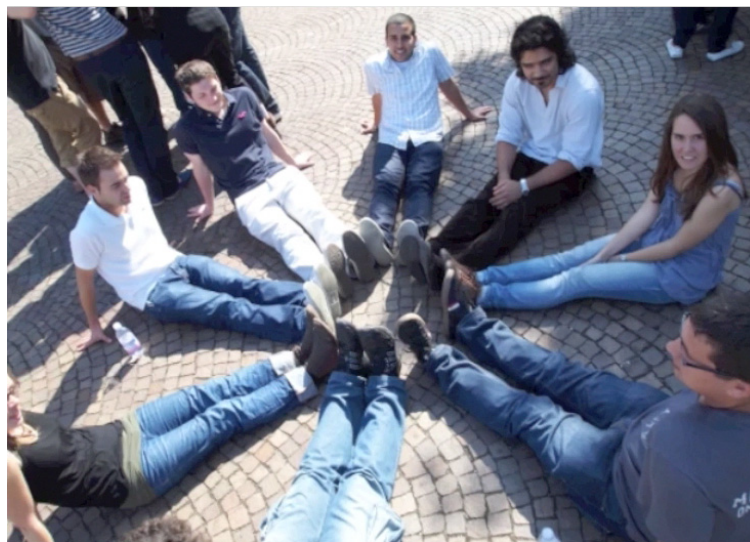
Fig. 2 Self-formation of groups through performative action during the stage 2

Stage 2 Taifa Letu Tujenge. The use of intensive and short workshops enables students to see and experience the work from a multicultural and international engaging perspective. There are also specific performative actions [21]. "Fig 2", for example, the first activity of the two-day workshop in Italy organised by Tesseract shows the importance of body-performance as self-act of forming new groups.