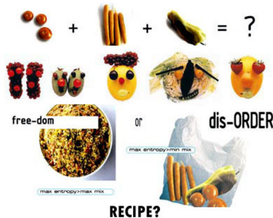
Fig. 3 Diagram of the composition of ingredients

The context plays a critical role in defining the degree of influence the system plays in its containing environment. The easy-to-understand metaphor of cooking is extensively used to make clear to the students that the whole process is a sequence of well organised stages. The combination of the stages along with their specific parts (structure, function, process, and context) might guarantee valuable results. “Fig 3”, but, you cannot just take the ingredients, no matter how good they are, throw them in a pot, add heat, and wait for a wonder to happen.